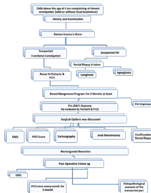
Fig. 1: STEP WISE APPROACH

colon) with partial removal of the rectum. Three surgical techniques were used, Open Rectosigmoidectomy, Transanal Pull-through Soave, and Laparoscopic Assisted Transanal Colectomy (or Needleoscopic)