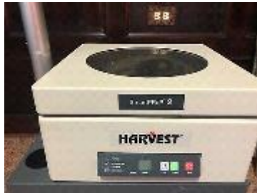
Smart PRP® (Harvest Technologies Inc)