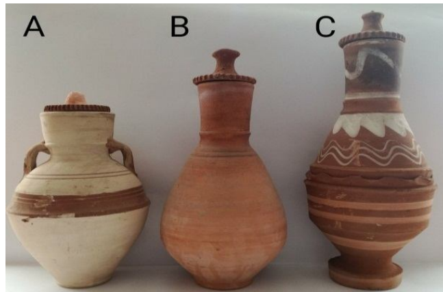
Fig. 2: Pottery jug (A), four of it purchased from Damietta Governorate; pottery jug (B) four of it purchased from El-Gharbia Governorate and Pottery jug (C), four of it purchased from El-Menya Governorate.