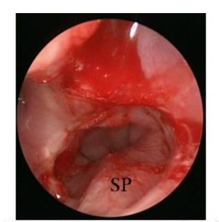
Figure (4): new choana after removal of the stent.