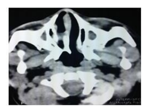
Figure (1): CT of bony type UCA