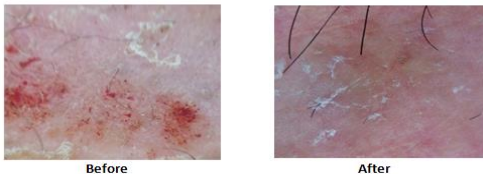
Fig (2): Dermoscopic pictures before and after treatment with topical nicotinamide.