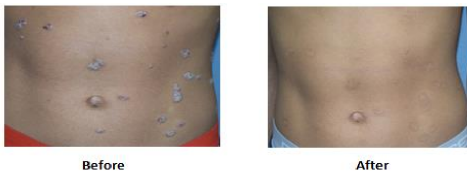
Fig (3): A 18 years old male with psoriasis before and after treatment with topical calcipotriol-betamethasone.