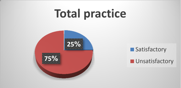
Figure (2): Percentage distribution of the studied mothers according to their total practice (n=100).

Figure (1): Percentage distribution of the studied mothers according to their total knowledge (n=100).