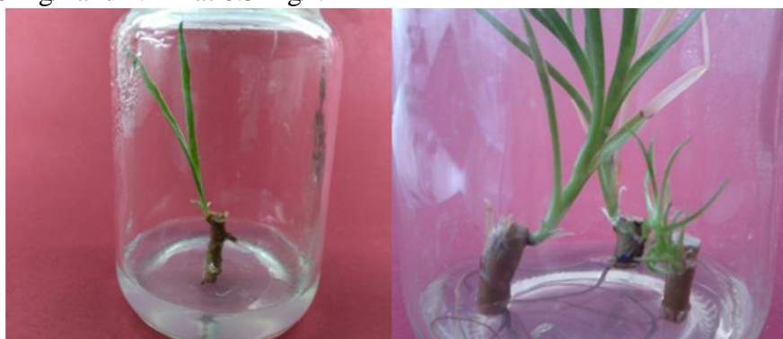
Fig. 2: Initiation stage of Dracaena draco single nodal grown in vitro on MS medium augmented with BA at 1.00 mg/l and NAA at 2.00 mg/l over 40 days

This was in agreement with the results obtained by Atta- Alla et al. (1996) and El-Sawy et al. (2000) on Dracaena marginata cv. Tricolor, who demonstrated that the highest shoot proliferation was obtained on MS medium containing BA at 4.0 mg/l and NAA at 0.05 mg/l. Beaura et al. (2007) showed that the presence of BAP at 2 mg/l with NAA at 0.5 mg/l produced significantly longer shoots and more leaves in Dracaena . Khan et al. (2004) reported profuse adventitious shooting of Cordyline in media containing a combination of kinetin at 4.0 mg/l and NAA at 0.5 mg/l.