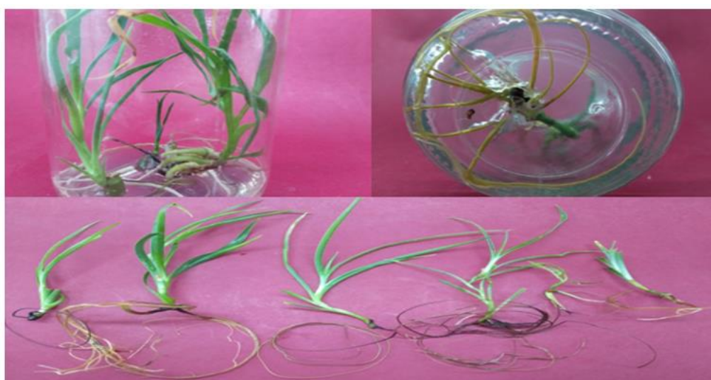
Fig. 4: Rooting stage of Dracaena draco shoots grown in vitro on MS medium plus IBA at 1.00 mg/l and NAA at 0.50 mg/l over 35 days.

L.S.D. (0.05) = Least significant difference test at 0.05 level of probability. *, **: Significant or highly significant.