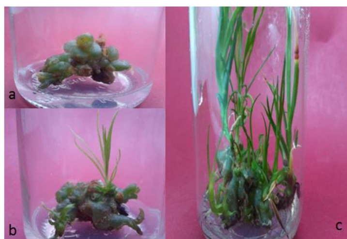
Fig. 5: Caulogenesis stage of Dracaena draco internodal segments (a and b) and shoots regenerations grown in vitro on MS medium augmented with BA at 0.5 mg/l and NAA at 2.00 mg/l over 60 days.

L.S.D. (0.05) = Least significant difference test at 0.05 level of probability. *, **: Significant or highly significant.