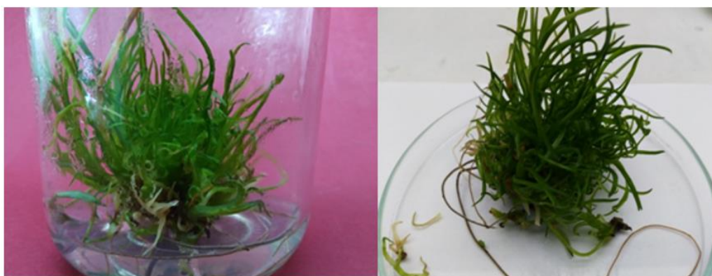
Fig. 3: Multiplication stage of Dracaena draco explants grown in vitro on MS medium augmented with BA at 4.00 mg/l and NAA at 1.00 mg/l over 60 days.

L.S.D. (0.05) = Least significant difference test at 0.05 level of probability. *, **: Significant or highly significant.