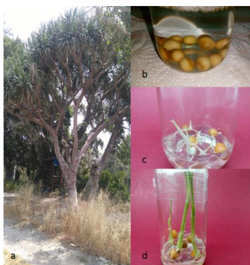
Fig. 1: In vitro seed germination of Dracaena draco on MS medium (a) Old D. draco tree in Antoniades Botanical Garden, (b) Seed preparation and sterilization, (c and d) Germinated seeds after 2 and 4 weeks.

Experimental design and statistical analysis, all the experiments carried out during this study were designed as factorial experiments layout in completely randomized design (Gomez and Gomez, 1984). Recorded data were analyzed statistically using the analysis of variance technique (ANOVA) and means were compared by L.S.D tests (Steel et al. , 1997) and significance was determined at p \leq 0.05 .