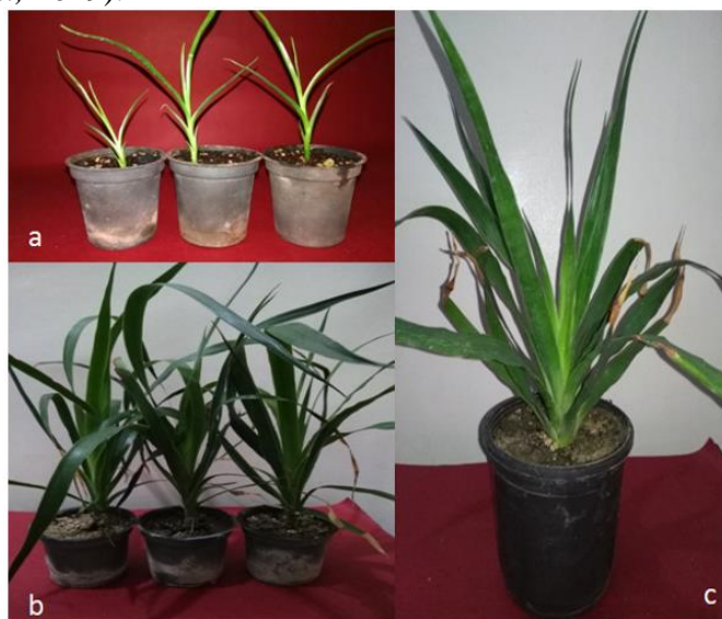
Fig. 6: Acclimatization stage of Dracaena draco shoots grown on rooting medium of peat moss and perlite at (1:1, v/v) over 4 weeks (a), and over 8 weeks (b), and over 6 months (c).

In this respect, material as peatmoss is one of the most important constituents of media due to its capacity in affecting plant growth either indirectly or directly. Indirectly, improves the physical conditions of media by enhancing aggregation, aeration (8%) and water retention (77%), thereby creating a suitable environment for root growth (Sensi and Loffredo, 1999). On the other hand, perlite is known to have a moderate capacity to retain water (38%) and provide' aeration (25%) and its neutral pH and the fact that it is sterile and weed-free. Hence, it is ideal for use in container growing substratum. Also, it is known that perlite decreases the bulk density of the soils and increases the porosity (Preece and Sutter, 1991, Abido, 2016). These results are in agreement with Vinterhaler (1989) for D. fragrans , Blanco et al. , (2004) for D. deremensis , and Miller and Murashige (1976) for D. godseffiana , Aslam et al. , (2.13) for D. sanderiana Sander ex Mast and by Liu et al. , (2010) for D. surculosa , Junaid et al. , (2010) for D. sanderiana Sander ex Mast and for Dracaena fragrans cv. Victoria (Jazib et al. , 2019).