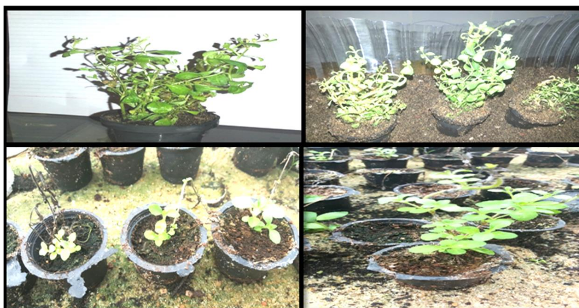
Fig. 2. Acclimatization of Stevia transplants in plastic pots