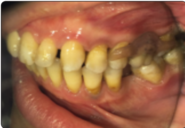
Fig. (1) Bre_flex clasp