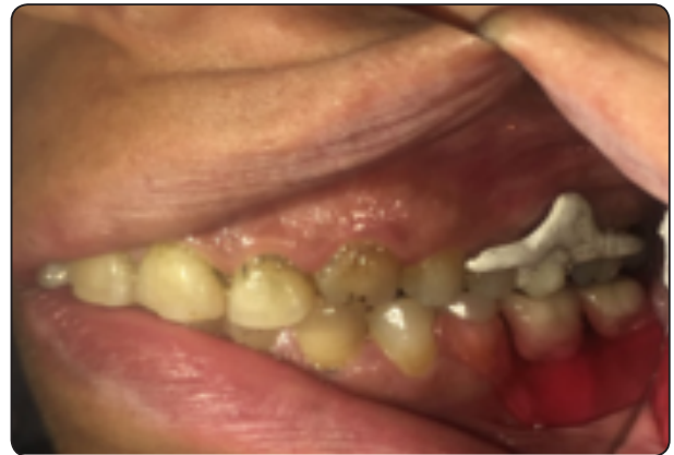
Fig. (2) PEEK clasp