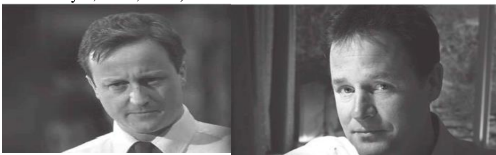
Figure 6 – image of Nick Clegg (The Guardian, 16 April 2010) (Machin & Mayer, 2012, P. 76)