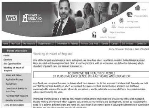
Figure 3 – Image of England Health Trust homepage (Machin & Mayer, 2012, P.54)