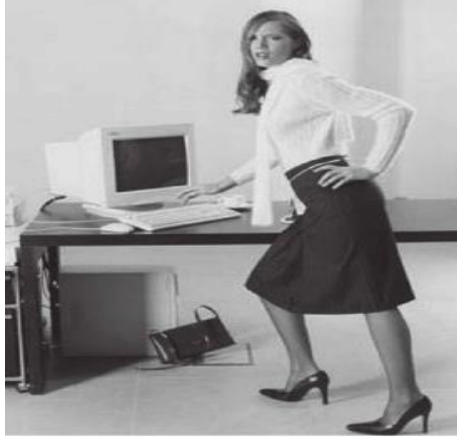
Figure 2 – image of a woman from Cosmopolitan magazine (Machin & Mayer, 2012, P.7)