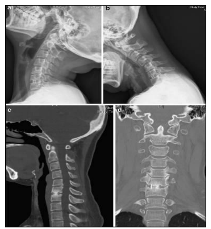
Figure (3) Shows lateral flexion-extension cervical spine radiographs (a–b) and sagittal-coronal CT scans (c–d) obtained 12 months after C6–7 anterior cervical discectomy and fusion. Evidence of solid bridging bone on CT scans and no instability on flexion-extension radiographs were demonstrated