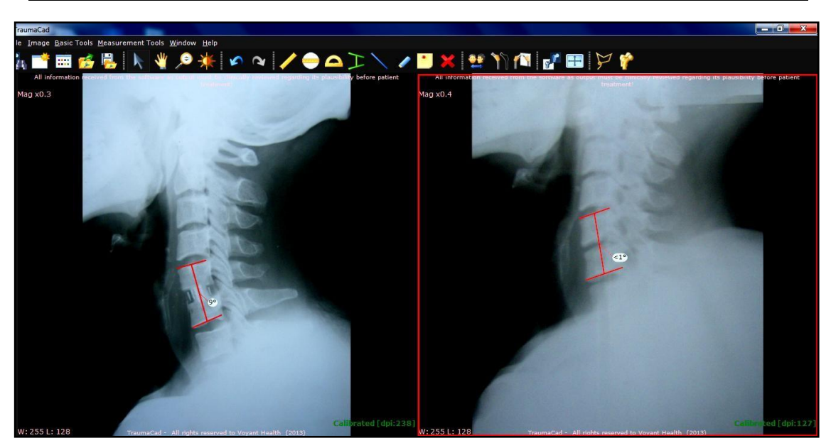
Figure (2) Shows software for measuring Segmental sagittal alignment (SSA) of the instrumented level (TraumaCad® - Voyant Health Ltd.)