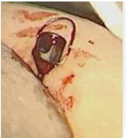
Fig. 1. Lippy-modified Robinson prosthesis