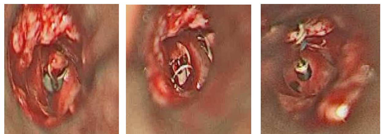
Fig.3. Lippy-modified Robinson prosthesis. Right ear