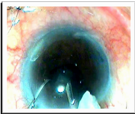
Figure (1) Phacoemulsification was performed through scleral tunnel.

keratome. Phacoemulsification was performed and the foldable posterior chamber IOL was implanted in the capsular bag, fig. (1). A posterior lip sclerectomy was performed underneath the scleral flap and a peripheral iridectomy was performed Followed by closure of the scleral and conjunctival flaps respectively, fig. (2).