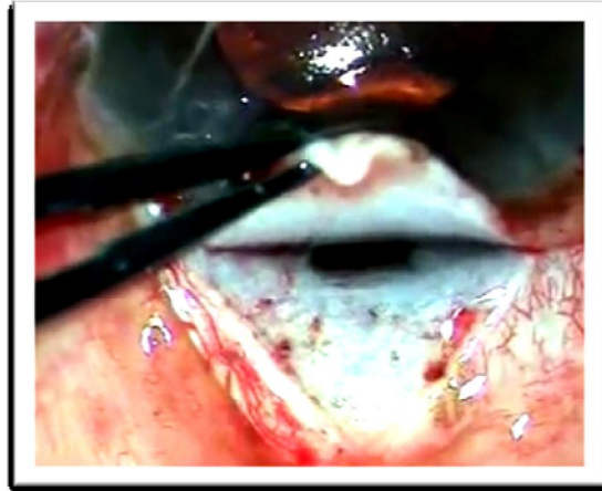
Figure (4) Filtration surgery was completed superiorly through separate site..

mulstification of the nucleus and implantation of a foldable posterior chamber IOL were performed, fig. (3). Again, the surgeon shifted superiorly and the filtration surgery was completed, fig. (4).