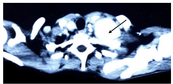
Figure 2 B: Computed tomography arteriography (CTA) showing left subclavian artery aneurysm (arrow)

Figure 2 A: Preoperative arch aortography showing left subclavian artery aneurysm (arrow)