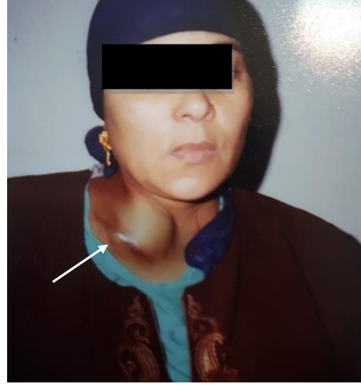
Figure1A: Photograph of right gaint subclavian artery aneurysm, complicated by thrombosis and distal brachial artery embolism showing right hand ischemia (arrow).