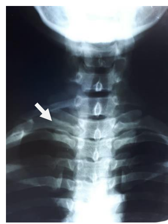
Figure1B: Plain x-ray of the neck showing right cervical rib (arrow)