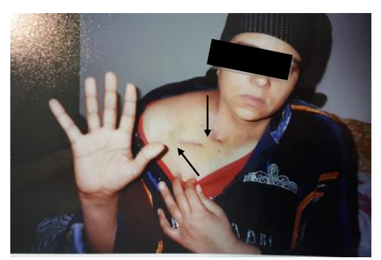
Figure1D: Postoperative picture showing two Supraclavicular and infraclavicular scars after decompression and excision of the aneurysm and reconstruction by interposition PTFE graft 8mm. After brachial artery embolectomy, the pallor of the ischemic hand was disappeared. (arrows)

Figure1C: Arch aortography showing gaint aneurysm of the right subclavian artery 58mm in diameter and brachial artery embolism due to (TOS) (cervical rib) (arrow)