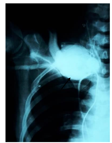
Figure1C: Arch aortography showing gaint aneurysm of the right subclavian artery 58mm in diameter and brachial artery embolism due to (TOS) (cervical rib) (arrow)

Figure1B: Plain x-ray of the neck showing right cervical rib (arrow)