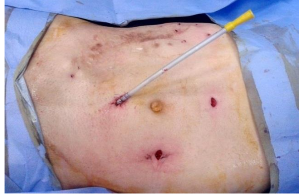
Figure [7]: Postoperative abdominal appearance with a demonstration of port sites and previous scar.