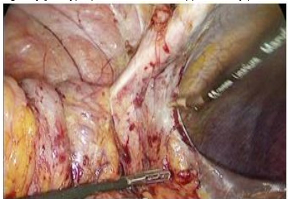
Figure [3]: Adheseolysis using vessel-sealing device.