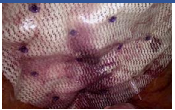
Figure [6]: Mesh fixed with sutures and tacks.