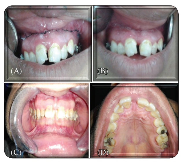
Fig. (5-A,B,C,D): A photographs showing of operation site at 2 days, 7days, 15days and after complete expansion.

Clinical evaluations were done at intervals of 2, 4, 7 and 15 days and directed toward the observation of the healing process, infection or any complications of wound healing. (Fig.5-A,B,C,D).