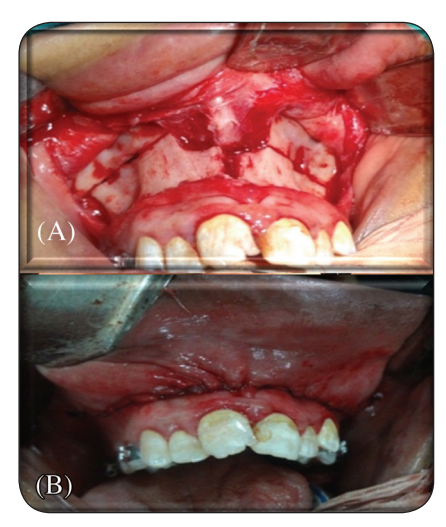
Fig. (4-A,B ):A photographs showing of bilateral osteotomy and closure of operation site by interrupted suture.

Closure: Finally, the wounds were closed as for a total maxillary osteotomy, taking care to reapproximate the musculature with deep periosteal sutures. Flap was returned to original position then pressed on the flap for a minute before suturing to gain initial adherence then sutured with 3-0 black silk suture by interrupted suturing technique. (Fig.4-B).