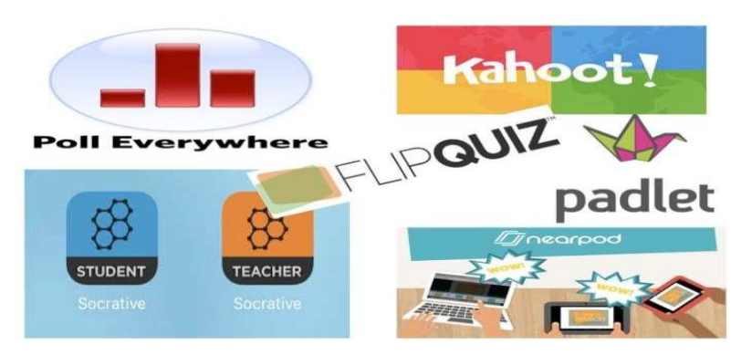
Figure 1: a collection of some SRS tools adapted from Shaban 2017 p.66

Microsoft PowerPoint, and plotagon. Figure 1 shows some popular apps or clickers: