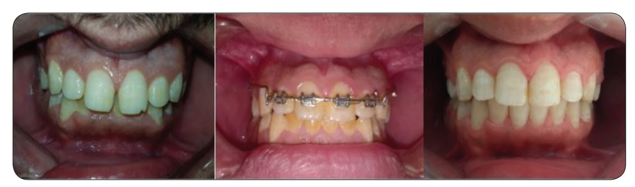
Fig. (2) A case presenting PMG before, during and after intrusion