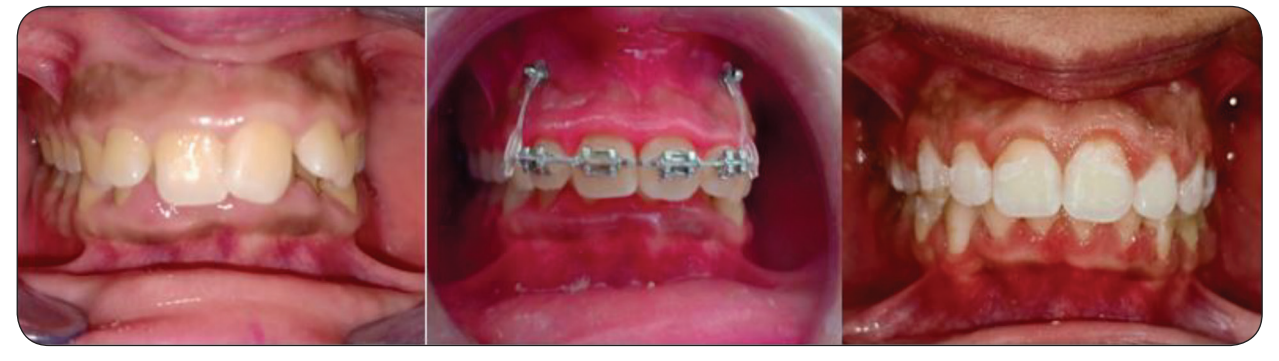
Fig. (1) A case presenting AMG before, during and after intrusion

The CR of the incisors showed distal movement (decreased CR-T), with labial tipping (increased 1-PP) in both groups; these changes were greater in the PMG.