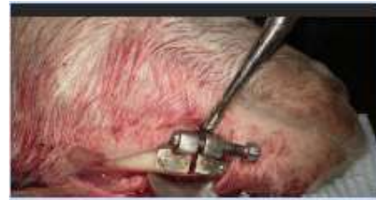
Figure 1: Distractor fixed in place

area was shaved prior to procedure. The area was scrubbed with Povidone-iodine 10-12% before the incision. Local anesthetic articaine 4% with 1:200,000 epinephrine field block was injected to reduce postoperative pain. The incision was done using size 15 Bard Parker surgical blades. A vertical osteotomy was done in the right-side of mandible using low speed hand piece associated with copious irrigation by saline followed by complete osteotomy using chisel and mallet. A stainless-steel mono-directional distractor was fixed in place at both osteotomy ends by two 2.0 mm mini screws. Trial activation and deactivation was made to assure function. An anterior skin puncture was done to allow exit of distractor activation screw through the skin for activation during distraction procedure. (Figure 1)