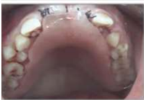
Figure 9: Intraoral photography showing palatal stent secured in position.

Follow up radiographs were done on 6 months, 12 months and 18 months interval postoperatively and showed significant movement of both central incisors incisally. The Right Central Incisor erupted at 12 months as shown in [Figure 11-12] and radiographic examination showed significant movement of left central incisor too [Figure 13].