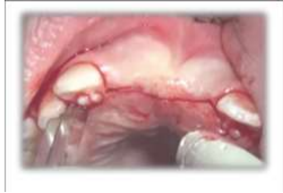
Figure 5: Intraoral photography showing crestal incision from canine to canine