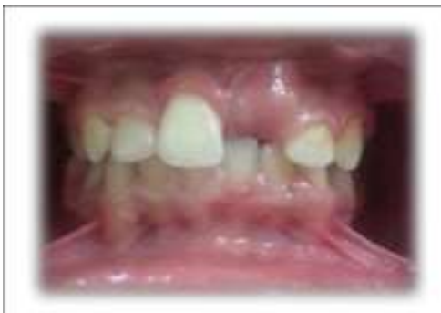
Figure 14: Intraoral Frontal View at 18 months postoperative showing failure of left central incisor to erupt and complete eruption of Right central incisor.

After 18 months postoperative the left central incisor failed to erupt as seen in intraoral frontal and occlusal photographs [Figure 14-15] and therefore after consultation with orthodontic department team surgical exposure was done [Figure 16-17].