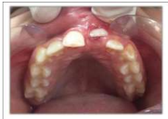
Figure 17: Intraoral Occlusal View showing surgical exposure of Left central Incisor.

Both central incisors were erupted by the 24 months postoperative and no recurrence was observed. Patient confirmed their eruption but failed to show up for further follow up.