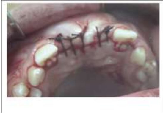
Figure 8: Intraoral photography showing flap repositioned in place and sutured.

A palatal stent was then placed to reduce hematoma and stabilize the palatal flap [Figure 9]. Both surgically removed odontomes were sent for histopathological examination [Figure 10]. Histopathological examination concluded that both lesions were compound odontomes.