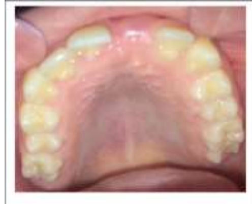
Figure 15: Intraoral Occlusal View at 18 months postoperative showing failure of left central incisor to erupt and complete eruption of Right central incisor.