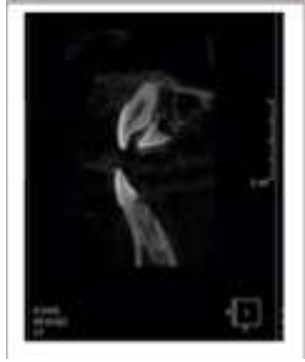
Figure 3: Axial View - showing Right Central incisor and palatal odontome.