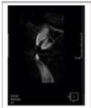
Figure 4: Axial View - showing Left Central incisor and palatal odontome.