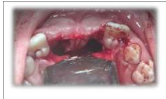
Figure 7: Intraoral photography showing surgical site following removal of both odontomes.

Both odontomes are then removed using a straight apexo elevator [Figure 7] and flap is repositioned in place again and sutured using 3-0 silk suture in interrupted fashion [Figure 8].