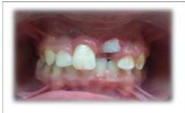
Figure 16: Intraoral Frontal View showing surgical exposure of Left central Incisor.