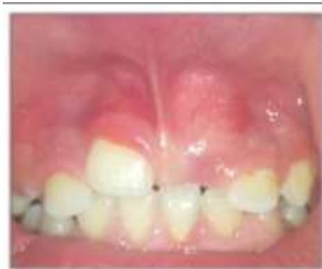
Figure 11: Intraoral Frontal View showing eruption of Right central incisor and bulge of Left Central Incisor at 12 months postoperative.