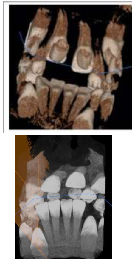
Figure 1: 3D reconstruction CBCT - showing 2 tooth-like masses palatal to both central incisors

assessment. 3-D Cone- beam Computed Tomography (CBCT) was done and showed two tooth-like masses palatal to the two maxillary permanent incisors as shown in [Figure 1-4].