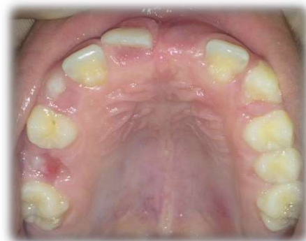
Figure 12: Intraoral Occlusal View showing eruption of Right central incisor and bulge of Left Central Incisor at 12 months postoperative.