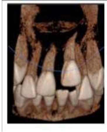
Figure 13: 3D reconstruction CBCT showing significant eruption of both central incisors after 12 months postoperatively.

After 18 months postoperative the left central incisor failed to erupt as seen in intraoral frontal and occlusal photographs [Figure 14-15] and therefore after consultation with orthodontic department team surgical exposure was done [Figure 16-17].