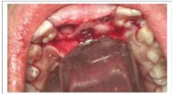
Figure 6: Intraoral photography showing refelected palatal flap, with odontomes visible.

After assessment of CBCT and consultations with orthodontic department team, it was concluded that both odontomes would be surgically excised to allow both permanent central incisors to erupt. Follow up period was set for 18 months, after which orthodontic traction would be done if both failed to erupt. The surgical procedure included an infiltration of 4% Articaine both buccally and palatally, crestal incision from the canine to the canine of the opposite side [Figure 5] with the subsequent reflection of a palatal flap [Figure 6]. No buccal flap was raised to preserve the integrity of the follicles of both impacted central incisors.