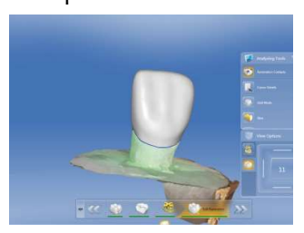
Figure 6: Showing proposed full coverage design – Group II