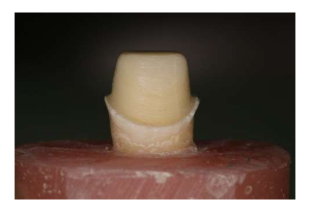
Figure 2: Group II – Full coverage

Preparation crown preparation (labial view)