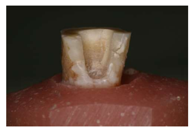
Figure 1: Group I – Endocrowns

The height of the prepared axial walls of all teeth was standardized to an average of (5.0 mm) above the CEJ to simulate the remaining tooth structure after caries removal.