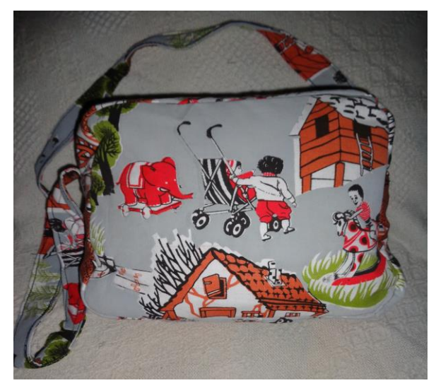
Design (2): Bag for Baby belongings, Jabrden white, Printed shapes (drawings for children and landscapes, prominent shades: red, green, brown, black, gray).