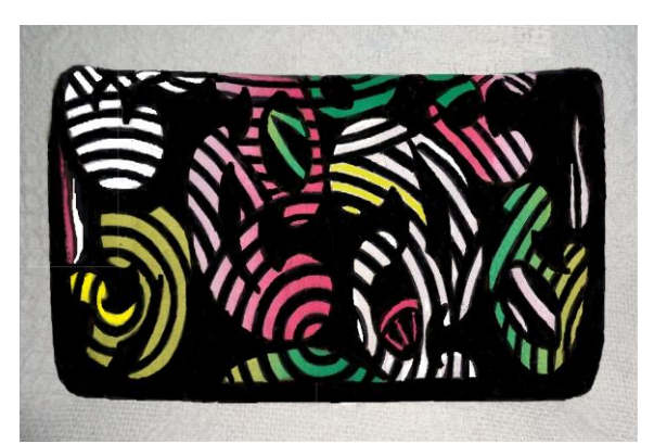
Design (3): Women's bag for occasions, shamuzette black, Printed shape (decorative forms, prominent shades: yellow, green, pink, white).