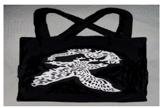
Design (5): Sport bag of shamuzette black, Printed shape (decoration of a mythical bird, prominent white colour).