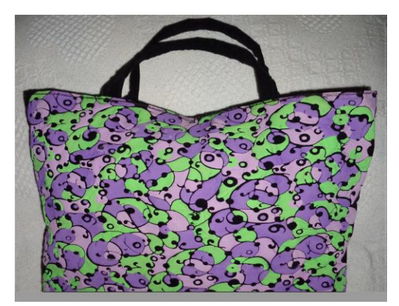
Design (4): large bag for shopping of shamuzette black, Printed shape (decorative units from nature, prominent shades: green, violet, pink).