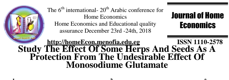
Journal of Home Economics, Volume 28, December (4), 2018