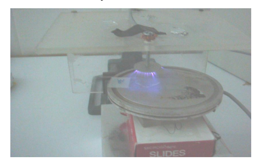
Fig. 1: Generation of cold plasma and samples treatment.

which are separated by an air gap. By covering one electrode with a strong dielectric, we keep the charge from following a direct path between electrodes. Lacking a specific path, the discharge spreads uniformly throughout the intervening space (fig.1). This study was conducted to determine the efficacy of plasma for inactivation of both gram-positive and bacteria gram-negative namely. Escherichia coli. Staphylococcus aureus and Pseudomonas aeruginosa. The strain mixture of each bacterium was inoculated (5x10^6 \text{ cfu/ml}) onto a microscope slides containing Muller Hinton agar media then samples exposed to plasma for 0, 30, 60 180 and 360 seconds.