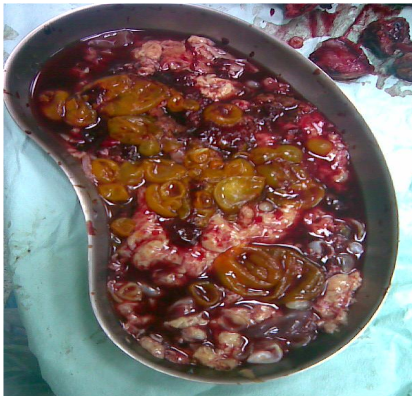
Figur-3: A lot of scoliosis removed from the converted case.