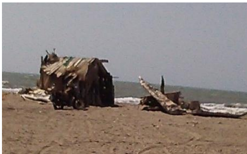
Fig. 3. Fishermen's nest.

On the coast of the Bay, the village of Al-Mabrouk is found, about 1 km from the coast from the end of the Bay, with a population no more than 300 people. Another village, with the name of Madian, has only 7 houses, with a population of about 30 people. In both villages, most of the people are working in fishing, agriculture and grazing. There are also some wild plant made-up nests established on the coast, used as rest sites for fishermen, preservation of fish and fishing equipments as well (Fig. 3). The fishing methods used are gill nets and small traps (Sakhwa) (Fig. 4) and large traps (petah), with small boats made of wood or fiberglass used in fishing operations in areas near the coast.