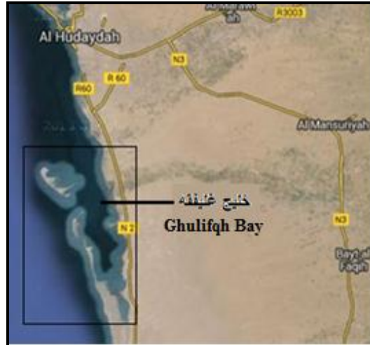
Fig. 1. Map showing the location of the Ghulifqh Bay in relation to Hudaydah city.