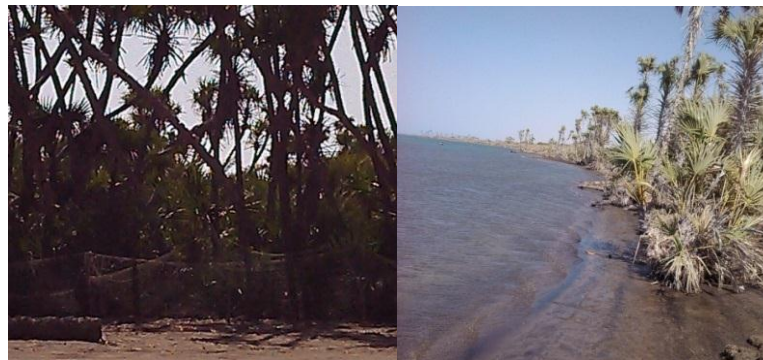
Fig. 2. The coast of the Ghulifqh Bay.

On the coast of the Bay, the village of Al-Mabrouk is found, about 1 km from the coast from the end of the Bay, with a population no more than 300 people. Another village, with the name of Madian, has only 7 houses, with a population of about 30 people. In both villages, most of the people are working in fishing, agriculture and grazing. There are also some wild plant made-up nests established on the coast, used as rest sites for fishermen, preservation of fish and fishing equipments as well (Fig. 3). The fishing methods used are gill nets and small traps (Sakhwa) (Fig. 4) and large traps (petah), with small boats made of wood or fiberglass used in fishing operations in areas near the coast.