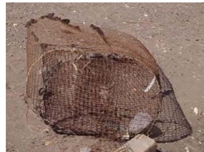
Fig. 4. A small trap (al-sukhwa).