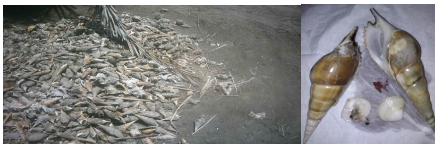
Fig. 6. Some types of gastropods in Ghulifqh region

In addition, cephalopod species (squid, sepia and octopus) and Cerithidae cingulato , Balanus amphitrite , coexist with several groups of other invertebrates such as Sponge, Coeleterates, Echinoderms, and their presence was less than the rest of the species. There are also different types of snails (Mollusca) in Ghulifqh Bay (Fig. 6), such as: Nerita undata , Planaxis sulciatus , Terebralia palustis , Conus tessolatus and Nerita polita .