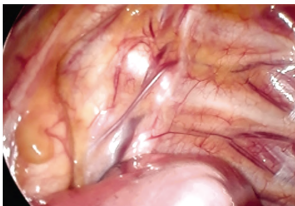
Fig. (1): Sympathetic chain along the side of the ribs.

All surgeries were done under general anesthesia with a double-lumen tube. Operations were done in the supine and semi setting position of the patient with the abduction of both arms to expose the axilla with table tilting. 10mm port was inserted at the second intercostal space in the midclavicular line with CO 2 insufflation and exposing the pleura cavity using 0 camera and identification of sympathetic chain along of the ribs. 5mm port was inserted in the midaxillary line at the fifth intercostal space for the diathermy hook. In group I: Cauterization and transection of sympathetic chain at T2 below the second rib while in group II cauterization and transection of sympathetic chain at T3 below the third rib Figs. (1,2). In both groups, cauterization of the Kuntz's nerve was done to achieve adequate denervation. Inflation of the lung under vision then the same procedure repeated on the other side. All patients had received analgesics and followed-up by a chest X-ray post-operatively and discharged after 24h except the complicated cases.