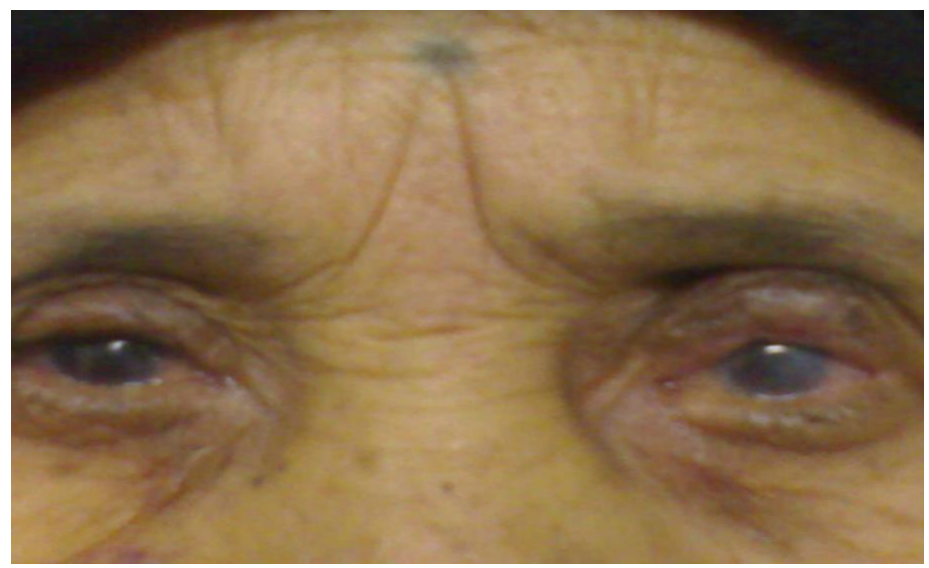
Figure (2): Bilateral postoperative follow up; Rt: successful. Lt: overcorrected