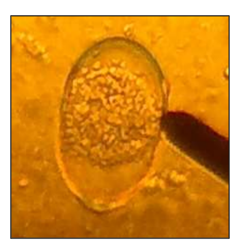
Fig. 2: oocyst of E. uniungulati (400x, using digital camera)