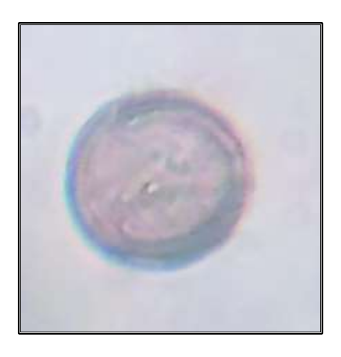
Fig. 3: oocyst of E.solipedum (400x, using digital camera)