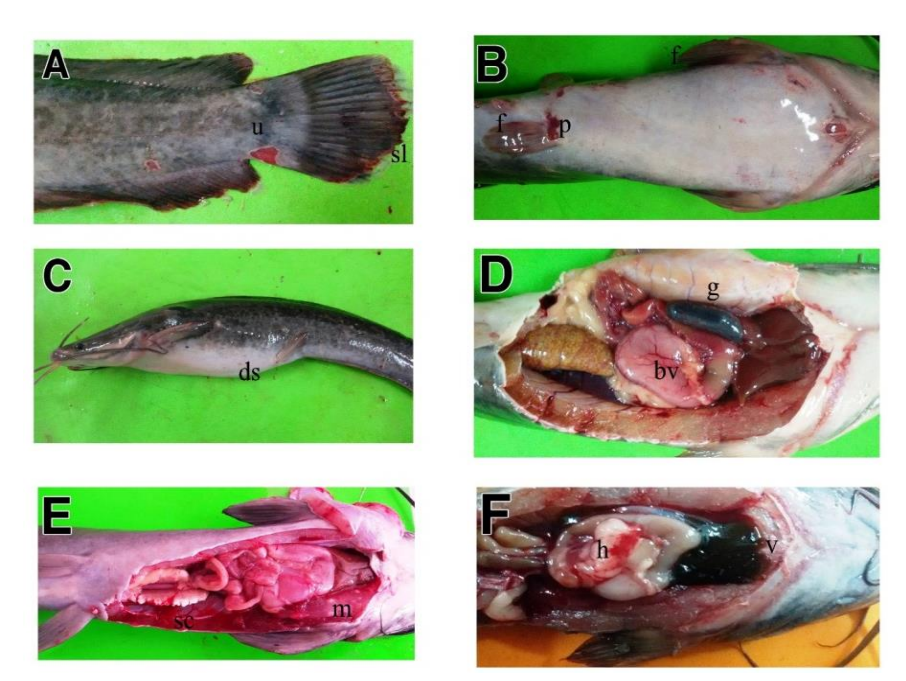
Figure 1: Sharptooth catfish, Clarias gariepinus , naturally infected with Citrobacter freundii showing: (A) ulceration (u), sloughing of the tips of fins and fin rot (sl), (B) congestion of pectoral and anal fins (f) and hyperemia of the anal region (p), (C) abdominal distension (ds), (D) congestion of abdominal blood vessels (bv) and enlargement of gall bladder (g), (E) hemorrhages on the muscles (m) and accumulation of bloody ascetic fluid (sc), (F) congestion of liver (v) and hemorrhages in abdominal cavity (h).