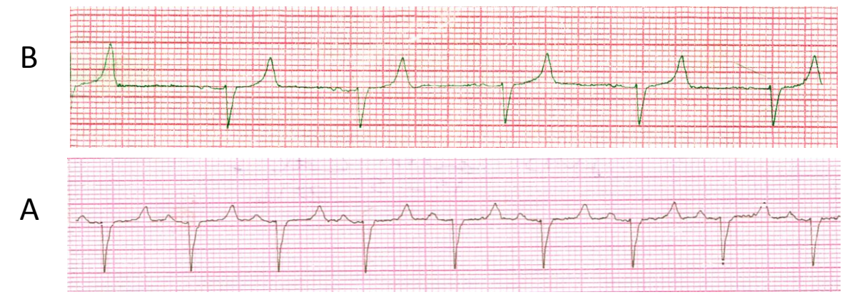
Fig. (1): ECG of FMD infected buffalo calf (B) showing bradycardia with ventricular premature depolarization which characterized by prolongation of T-wave with flattening of P- wave and increased QRS duration with decrease in its amplitude compared with healthy calves (A).

Histopathological examination of the heart of dead calves revealed severe interstitial myocarditis with heavy inflammatory cellular infiltration consisting of lymphocytes, macrophage and plasma cell (Fig. 4a). Zenker's necrosis of the myocardial muscle with massive leukocytic cellular infiltrates accompanied by distortion and dissolution of the myocardial parenchyma was also observed (Fig. 4b).