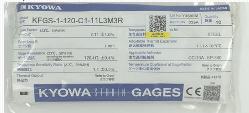
Figure (13): Stain gauge

length was 2 mm, the gauge resistance was 120.4 \pm 0.4 ohm and the gauge factor was 2.09 \pm 1.0\% . Strain gauges were connected to lead wires 100 cm in length; a packing material insulated the wire used for the strain gauges. (Figure 13)