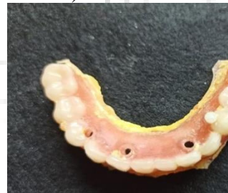
Figure (11): the acrylic resin overdenture deflasking

Waxing up, flasking, wax elimination, packing and curing of the heat-cured acrylic resin 23 followed by deflasking, finishing and polishing of the denture was done then the denture was tried to fit to the cast to be passively seated (figures 11&12)