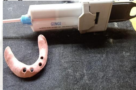
Figure (2): Gingival simulator

Mucosa simulation was done via gingival mask material 4 (Figure 2).