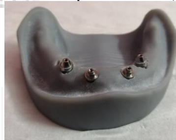
Figure (3): 3D cast with implants with multi-unit abutments.

Angled multiunit abutments (screw-retained abutments) attached to the peripheral implants whereas straight multiunit abutments attached to the central implants using hex screwdriver to ensure parallelism 5 (Figure 3)