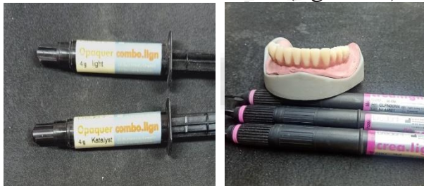
Figure (9): The opaquer composite material

After that the opaquer 18 was applied on the framework to block and fill the spaces between the frame lingually, then all was pressed using silicone key to be sure that all are closed and excess were removed (figure 9). Then setting of the teeth was done on the framework and adhesive composite 19 was used for veneers cementation then a nano filled composite 20 dentin shade was layered to fill the gingival portions and the gum portions was constructed 21 (figure 10)