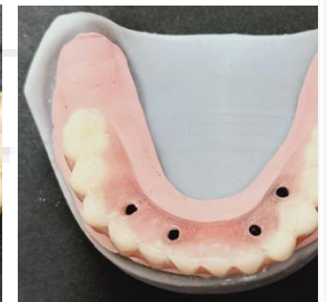
Figure (12): Finished and polished acrylic resin overdenture