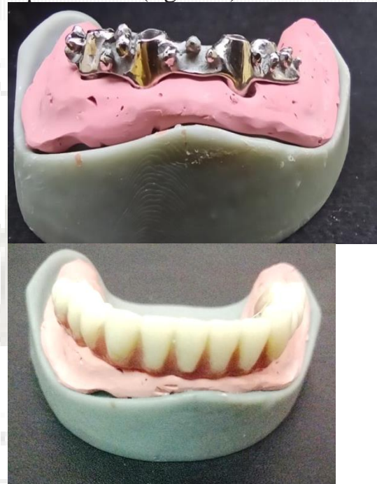
Figure (4): Metallic framework after finishing and polishing Waxing -up, flasking, wax elimination, packing and curing of the heat-cured acrylic resin followed by deflasking, finishing and polishing of the denture was done then the denture was tried to fit to the cast to be passively seated 7 .

was performed using the cobalt chromium alloy. After divesting, finishing, and polishing the framework, when divesting the casting, it is important not to sandblast the abutment interface. Then finishing and polishing of the casting was done and checked for a passive fit (figure 4)