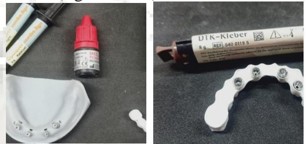
Figure (7): MKZ primer and visio-link primer

blasting of the abutment holes of the BioHPP framework and the titanium sleeves via the sand blasting device 12 Then adding the adhesive material (MKZ primer 13 on titanium sleeves and visio-link primer 14 for the BioHPP framework abutment channel) then the framework was cemented to the titanium abutments via (DTK dual cured resin cement 50-50) 15 and light cured for 90 seconds (figures 7&8)