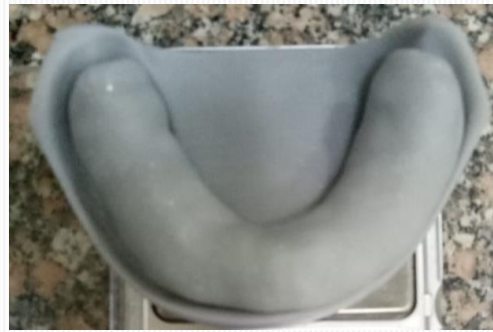
Figure (1): 3D printed cast.

The raw material used in production of the printed item is a photopolymer, which in fact is a mixture of acrylic acid esters and photo initiator 3 . (Figure 1)