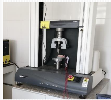
Figure (14): Universal testing machine A four-channel strain-meter was used to assess the strains induced by the applied load.

Universal Testing machine 26 used for applying standardized vertical static loads ranging between 0-100 Newton on the loading points, which is equivalent to the moderate level of biting force. The loading device consists of a base, frame, model fixture and the loading point. The base made from a steel sheet of metal 1 mm in thickness with an inverted U-shaped form.(figure 14)