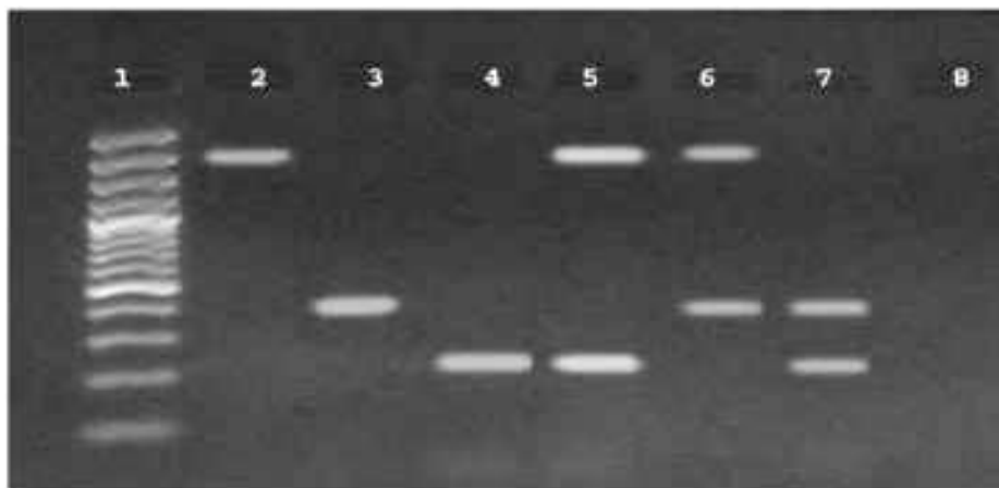
Fig. 4: Multiplex PCR products amplified from DNA. Lane 2, Staphylococcus aureus ; Lane 3, Streptococcus agalactiae ; Lane 4, Escherichia coli ; Lane 5, Staphylococcus aureus and Escherichia coli ; Lane 6, Staphylococcus aureus and Streptococcus agalactiae ; Lane 7, Streptococcus agalactiae and Escherichia coli . Lane 1, 100 bp DNA marker and Lane 8, Negative control.