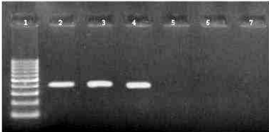
Fig. 3: PCR products (405 bp) amplified from Streptococcus agalactiae DNA from: Lane 3, positive clinical mastitic milk sample; Lane 4, positive sub-clinical mastitic milk sample. Lane 5, negative clinical mastitic milk sample; Lane 6, negative sub-clinical mastitic milk sample. Lane 2, Control positive; Lane 7, Negative control and Lane 1, 100 bp DNA marker