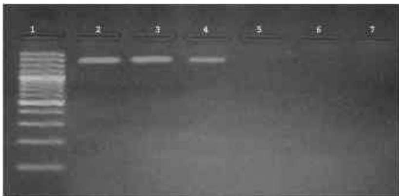
Fig. 1: Polymerase chain reaction products (1318 bp) amplified from Staphylococcus aureus DNA. Lane 3, positive clinical mastitic milk sample; Lane 4, positive sub-clinical mastitic milk sample. Lane 5, negative clinical mastitic milk sample; Lane 6, negative sub-clinical mastitic milk sample. Lane 2, Control positive; Lane 7, Control negative and Lane 1, 100 bp DNA marker