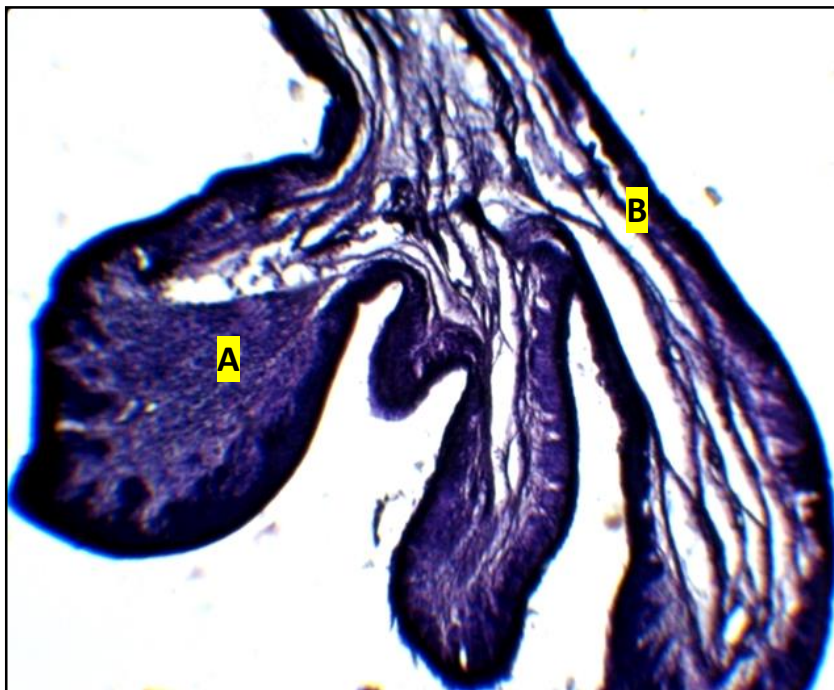
Figure 1. Hematoxylin-eosin-stained fragments of the sheep's small intestine; (A) Intestinal villi and (B) Lamina propria.

In the current, we discovered that partial atrophy of the intestinal mucosa, common dystrophic changes in the epithelium and destruction of individual goblet cells characterize microstructural changes in the small intestine of Paramphistomum cervi infected sheep after Antitrem treatment. Proliferative hyperplastic manifestations predominate in the small intestine tissues, manifested by an increase and proliferation of villus epithelial cells and mucous membrane crypt. The villi and crypt epithelium were high, with basophilic nuclei that were intensely stained and oxyphilic cytoplasm with large and numerous secretory inclusions in the apical sections of cells (Figure 1).