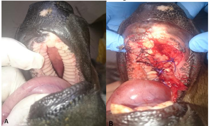
Fig.3. Cleft palate in 4 days-old male calf (A), and the surgical treatment using combination of unilateral mucosal inverting flap and buccal advancement flap (B).

Fig.2. 2- days old, calf suffered meningocele (A), lateral radiograph of the same calf with meningocele (B), The surgical removal of the external and internal sacs of the meningocele at the base of the cranial bones (C).