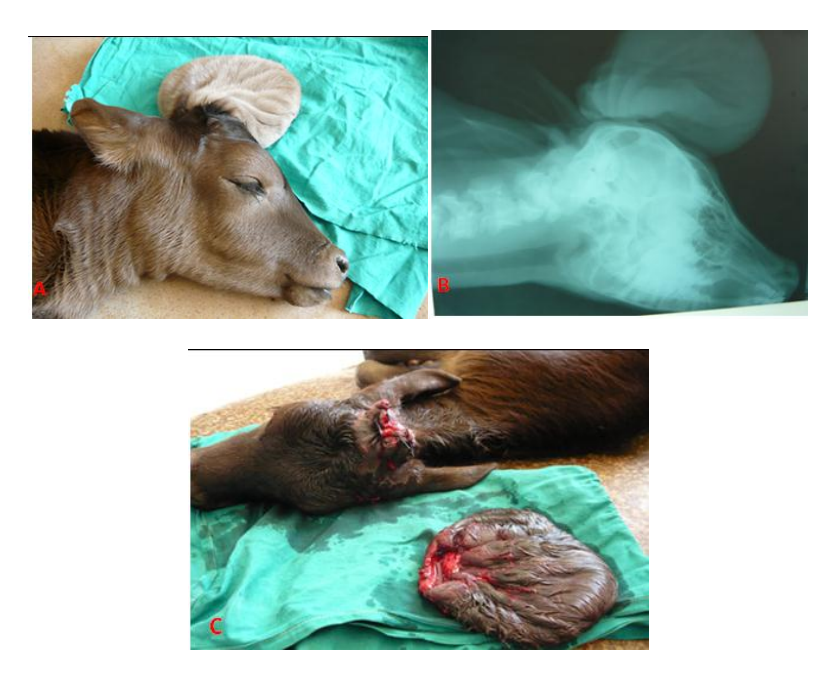
Fig.2. 2- days old, calf suffered meningocele (A), lateral radiograph of the same calf with meningocele (B), The surgical removal of the external and internal sacs of the meningocele at the base of the cranial bones (C).

Fig.1 . 3- days, old calf with a dome shaped forehead as a characteristic sign of hydrocephalus (A), and 2- days old calf that had different deformities in the head such as hydrocephalus, achondroplastic malformation (bulldog calf), anophthalmia and prognathism (B).