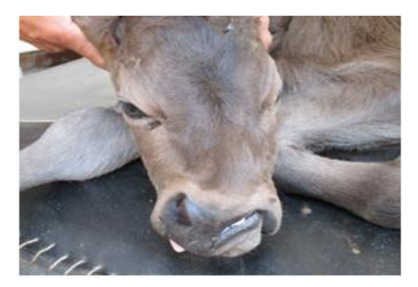
Fig. 8: 3-days old calf had wry nose, harelip.