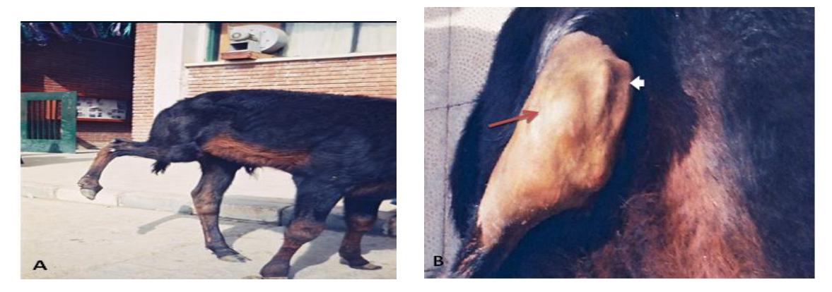
Fig. 10: (A) Lateral luxation of the patella in a male calf showing severe degree of flexion of the stifle and hock joints. (B): Close-up of figure A showing lateral luxation of the patella (arrow) relative to the femoral trochlea (arrow-head).