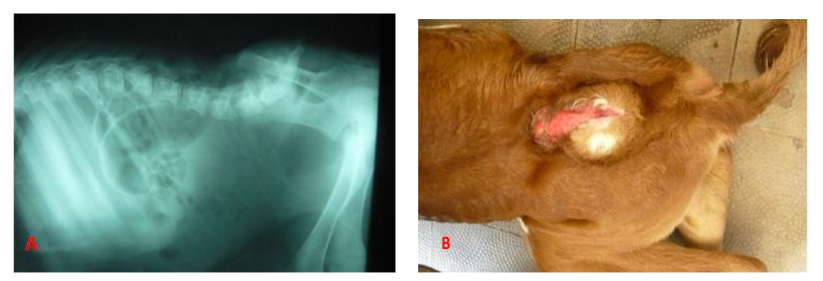
Fig. 7: Lateral radiographic view of the abdomen of 2-days old calf suffered atresia ani et recti with lordosis (ventral deviation) of the lumbar vertebrae (A), and non-peneterating spina bifida of 3 days old calf (B).