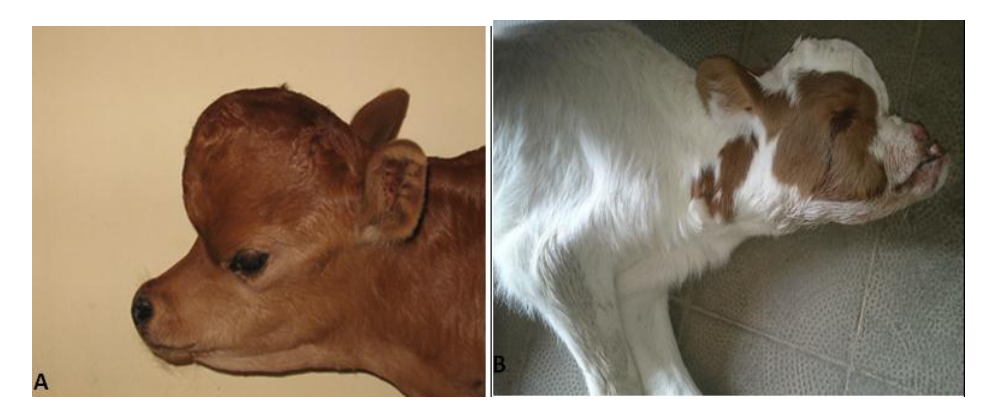
Fig.1 . 3- days, old calf with a dome shaped forehead as a characteristic sign of hydrocephalus (A), and 2- days old calf that had different deformities in the head such as hydrocephalus, achondroplastic malformation (bulldog calf), anophthalmia and prognathism (B).