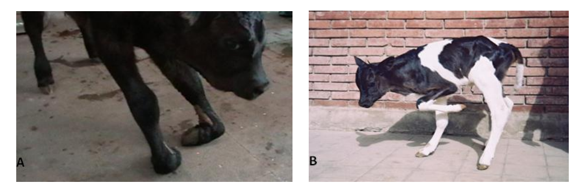
Fig. 5: Contracted tendons lead to the flexion of the fetlock joints of the two forelimbs (A), and the flexion of the carpus of the left forelimb (B) in newly born calves.