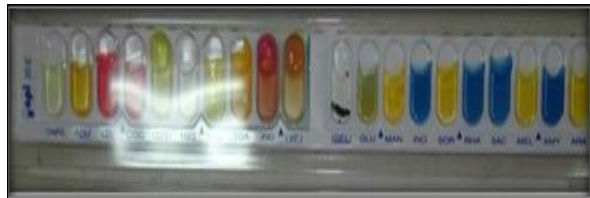
Figure 3: The results of biochemical tests in API 20E system by isolated strain of Escherichia coli .

Instead of biochemical API 20E tests, PCR and its related method have been reported to identify E. coli . In this study, the isolated E. coli organisms from colibacillosis diseased birds were grown in nutrient broth, DNA was extracted and amplified by PCR using ECO-f and ECO-r primer targeting E. coli 16S ribosomal DNA. On agarose gel electrophoresis, single band was visualized at molecular weight of 585 bp, (Fig. 4).