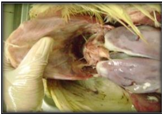
Figure 2: Shows typical perihepatitis in broiler chicks caused by avian colibacillosis

Escherichia coli / vaccine strains were obtained from chickens died with colibacillosis (Fig.2), the results