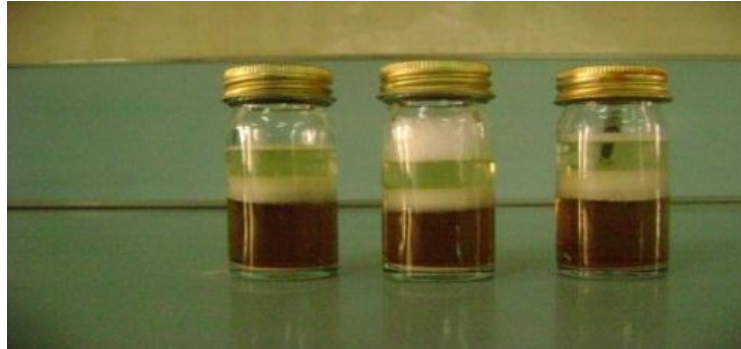
Figure 1: Showed 3 main phases. Aqueous phase, phenolic phase, and other phase represent proteins and other waste product.

Collection the water phase resulting from the processes of extraction and adding to it 1 mg/ml of DNase, RNase then incubate at 37 °C for 24 hours, and then held for the solution process of dialysis against distilled water for 4 days. Then the liquid is maintained collected.