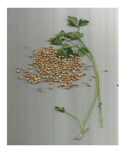
Fig. 1: Coriander seeds and plants cultivated in Libya.

After 21 days, data were recorded including seeds germination and all growth parameters of all treatments of coriander plants (Figure 2).