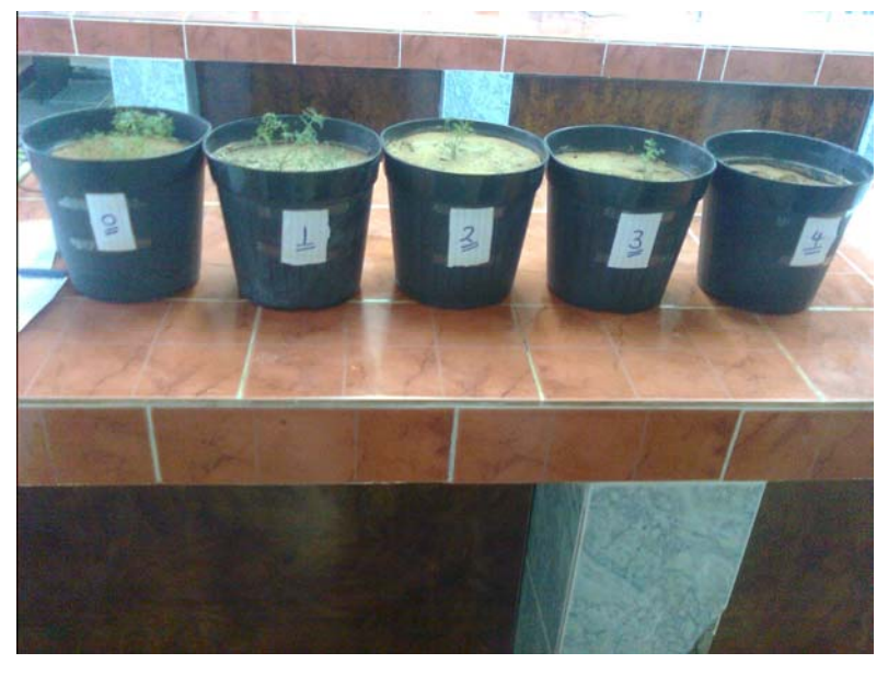
Fig. 2: Different treatments of Coriander plants grown in pots.