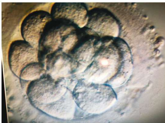
Good quality 16 cells embryo