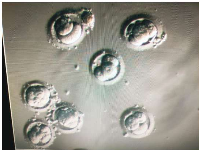
Embryos at different stages