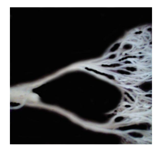
Fig. 6: Mucus gland of treated E. vermiculata with chlorfluazuron, atrophy cells, irregular tubules, and disappeared the mucus in the branches.