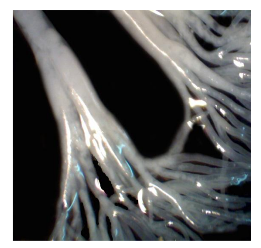
Fig, 5: Mucus gland of treated E. vermiculata with Acetylsalicylic acid, swelling cells, necrosis, and conglomerate the mucus in the branches.

Fig. 4: Mucus Gland of untreated Eobania vermiculata, much branched, arranged tubules.