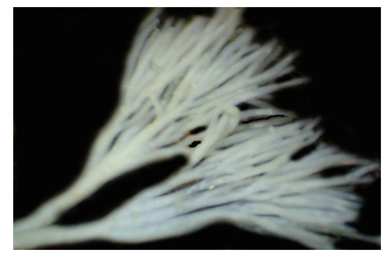
Fig. 4: Mucus Gland of untreated Eobania vermiculata, much branched, arranged tubules.

cells full of mucus. Figure (5) shows the effect of the acetylsalicylic acid on the mucus gland. It is cleared that there was increase in the volume of cells of gland cells, swelling cells and necrosis in the mucus. Also, the mucus was conglomerate in the branches of the mucus gland. While, Figure (6) revealed the effect of chlorfluazuron on the mucus gland. It was observed that there is a decrease in the volume of the cells of gland cells. It shows that the pair of tubules in the treated gland was irregular with atrophy cells, with no mucus in the cells.