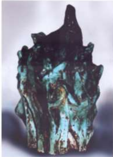
Fig.7: Death , 1970, Ceramic glazed, 45cm×30cm, Artist's private collection, @Mona Taha Hussein