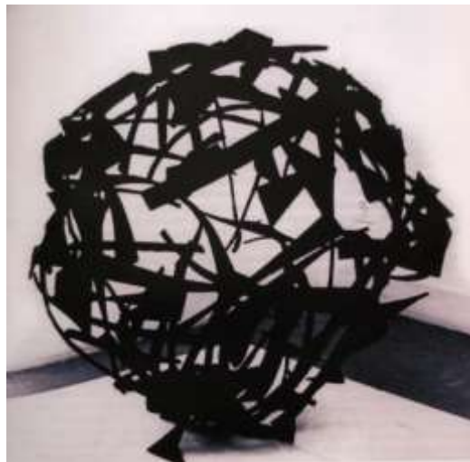
Fig.17: Israel vision of peace , 1975, The Museum of Egyptian Modern Art, Iron, 100 cmx100cm, (photo @ Hazem Taha Hussein)

The sculpture is made out of scrap metal and symbolizes the world and Israel's views toward peace with the Arab world.