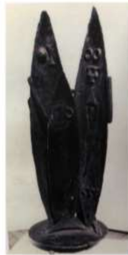
Fig.10: The Family , 1977, Iron, 150 cm×60cm, Artist's private collection, @Mona Taha Hussein