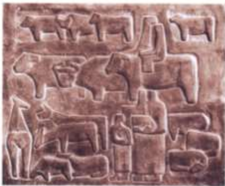
Fig.6: Egyptian countryside , 1960, Colored Gypsum, H.45×W.35 cm, Private collection, Germany, @Mona Taha Hussein