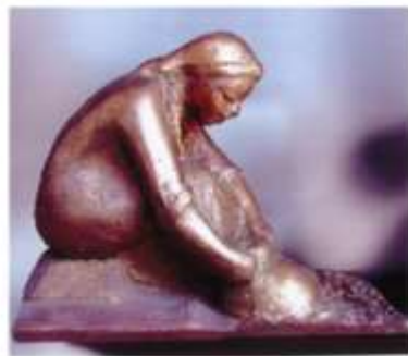
Fig.2: Jar holder , 1954, Colored Gypsum, 25×18 cm, Artist's private collection, @Mona Taha Hussein