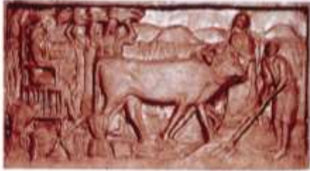
Fig.3: The harvest , 1955, Colored Gypsum, H.120×W.60 cm, Artist's private collection, @Mona Taha Hussein