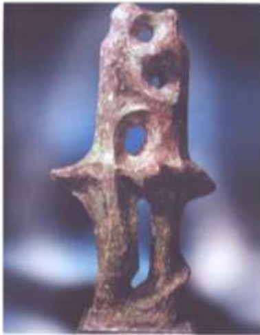
Fig. 13: Meeting , 1997, Polyester, 106cm×59cm×20cm, Artist's private collection, @Mona Taha Hussein