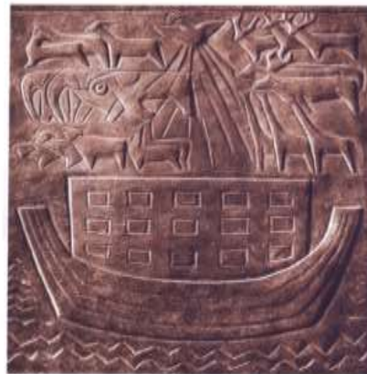
Fig.5: Noah's Ark , 1960, Bronze, H.45cm×W.30cm, Artist's private collection, @Mona Taha Hussein