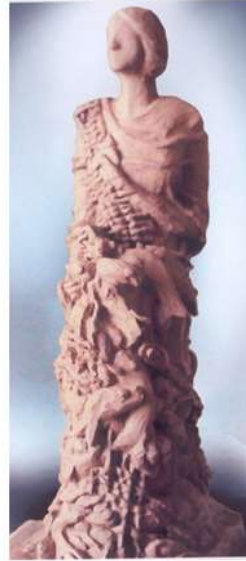
Fig.12: Liberality , 1986, Polyester, 66cm×27×20cm, Faculty of Art & Education, Helwan University Museum, Cairo, @Mona Taha Hussein