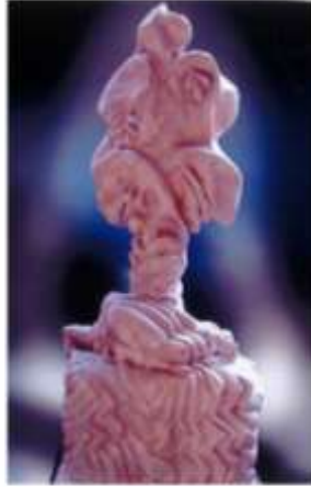
Fig.11: Belonging to the Homeland , 1980, Polyester, 103cm×52cm×28cm, Artist's private collection, @Mona Taha Hussein