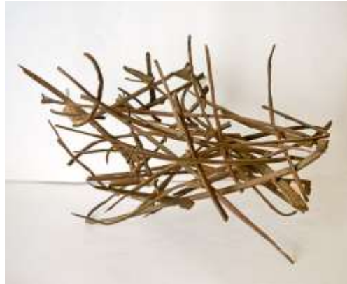
Fig.15: Explosion ,1970, The Museum of Egyptian Modern Art, no.6714, Iron steel, H.49x W.58cm, (photo @ Hazem Taha Hussein)

The Explosion is considered one of her most important sculptures. It is made out of a group of scrap metals with different lengths and forms. The significance of the sculpture is closely linked with the time of the execution, where the Egyptian nationalist spirit was extremely weakened. Many Egyptian cities have been attacked and even occupied by Israel. Soliman used the scrap metal of buildings and vehicles. In an extraordinary usage of very sharp metals, depicted the sculpture the mortal moment of the explosion, and symbolized through the split sharp-edged bars the inner pain in the Egyptian society.