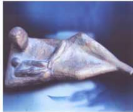
Fig.14: The Motherhood , 2002, Bronze, 22.5cm×10cm×7.5cm, Artist's private collection, @Mona Taha Hussein