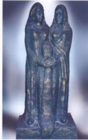
Fig.4: Egypt and Sudan , 1955, Colored Gypsum, 90×60×40 cm, Artist's private collection, @Mona Taha Hussein