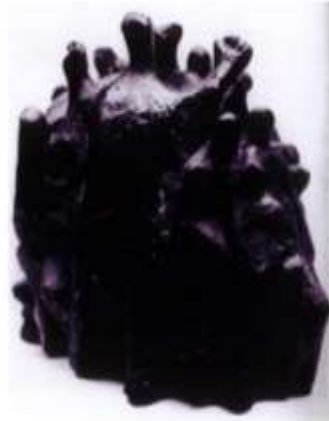
Fig.8: The awakening , 1973, Ceramic colored black, 50cm ×35cm, Private collection Germany, @Mona Taha Hussein