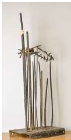
Fig.16: The Arab unification , 1974, The Museum of Egyptian Modern Art, no.8276, Iron, 120cmx70cm, (photo @ Hazem Taha Hussein)