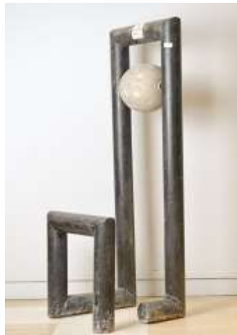
Fig.18: Stability and movement , 1975, colored Iron and white metal, 180cmx120cmx50cm, The Museum of Egyptian Modern Art, no.7516, (photo @ Hazem Taha Hussein)

The sculpture combines the movement of the ball to the right and the left, and it is an actual movement that occurs when the ball is moved and the discretionary movement represented by the movement of the iron figure in the void and its repetition, as if it were an increasing succession that achieves the ratio of the shape and the space between it (1:2)