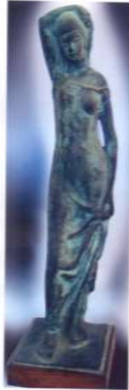
Fig.1: Egyptian farmer , 1952, Colored Gypsum, 45×15×15 cm, Artist's private collection, @Mona Taha Hussein