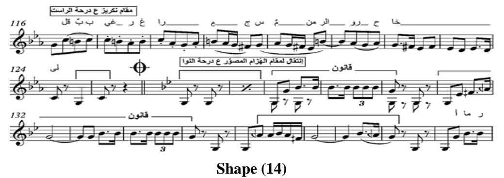
The maqam from The Noa's defeat to rast at the degree of rast: from M (168): M (181) from the place of a pictorial defeat on the level of the nawa, and from m (182): M (185)1 rast at the degree of rast.

- The maqam-based transition from the "nakriz' to the head", to the degree of the nucleus of m (116)1: m (125) from the shrine of The Narez, from m (126): m (140) from the place of a pictorial defeat on the level of the nucleus.