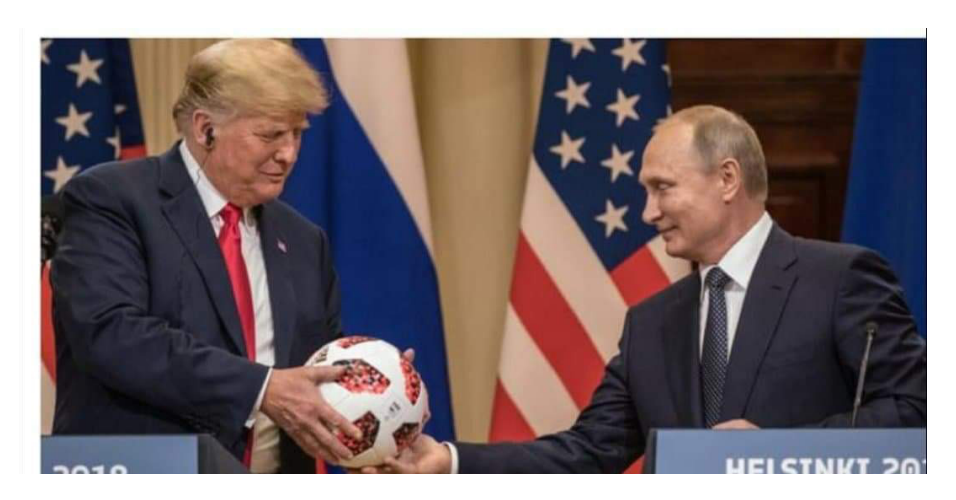
Figure (6): example of the medium distance shot at eye level