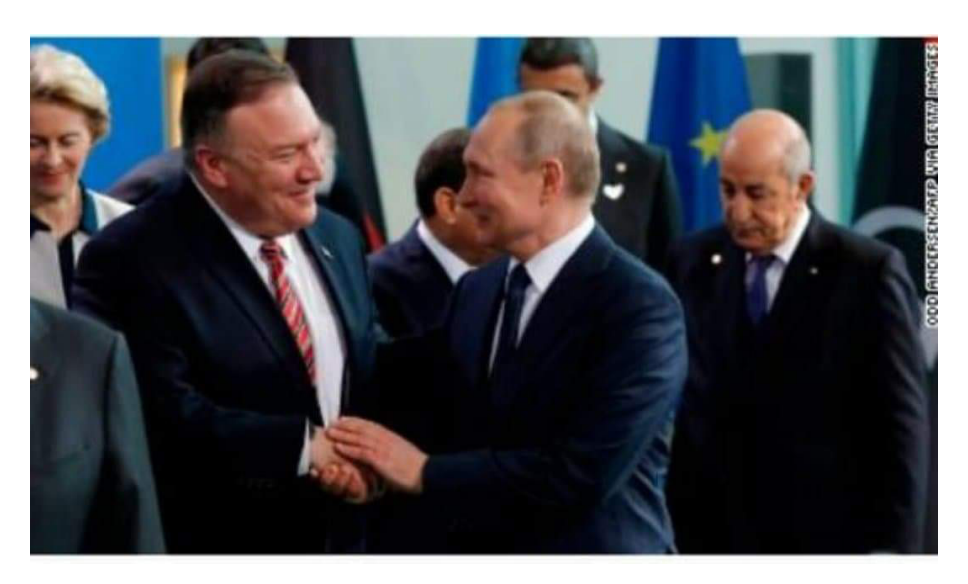
Figure (12):example of the political frame