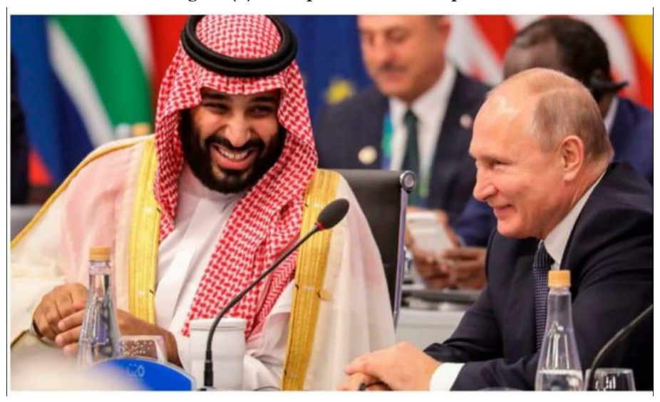
Figure (5): example of the political frame