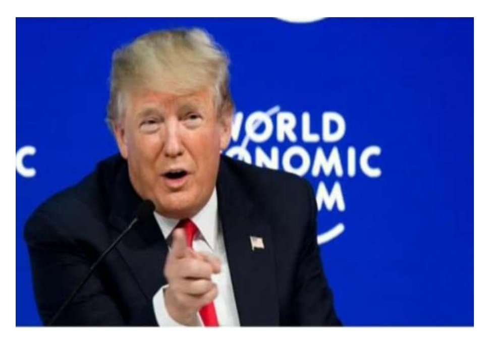
Figure (8):example of the gain frame