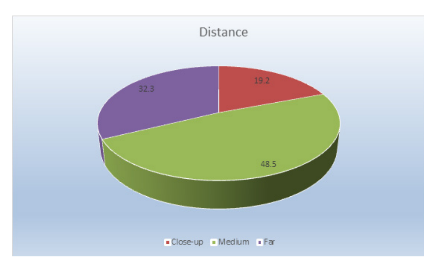
Figure (2): Subject to camera distance (Chi square= 12.788, df= 2, p= 0.002)

The second hypothesis of predicted presidents would be photographed at a medium distance more than a far distance or close to the camera. Medium distance photographs occurred most frequently and accounted for about 48.5% of the total, the one-way Chi-square test calculation was 12.788, p= 0.002, this was a significant difference, and the second hypothesis was supported.