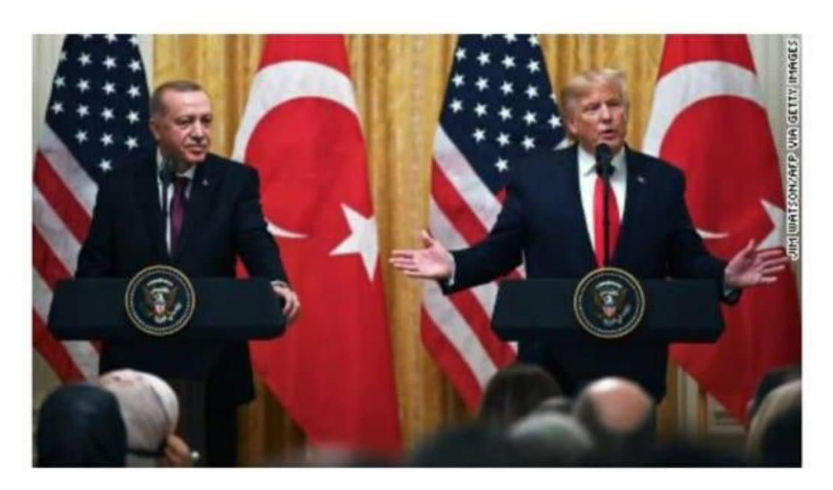
Figure (13): example of the conflict frame