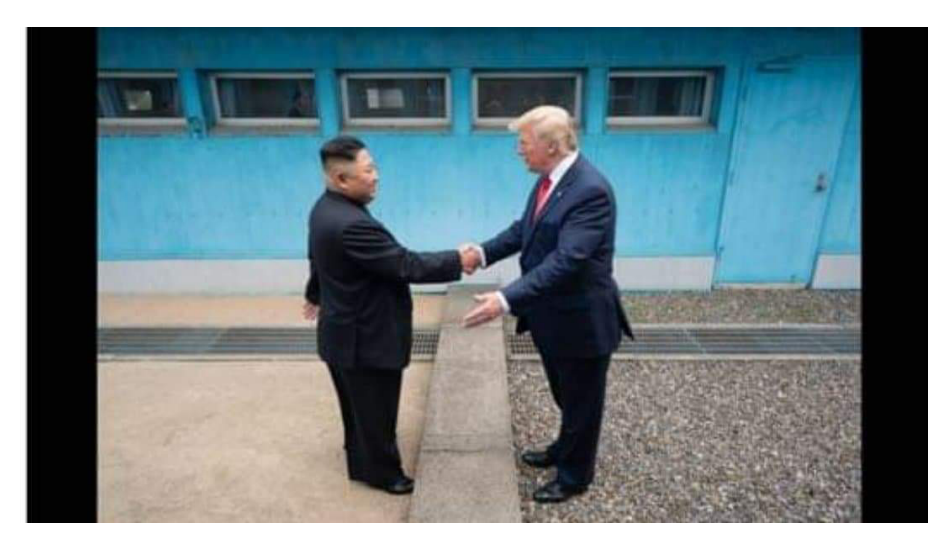
Figure (10): example of the political frame