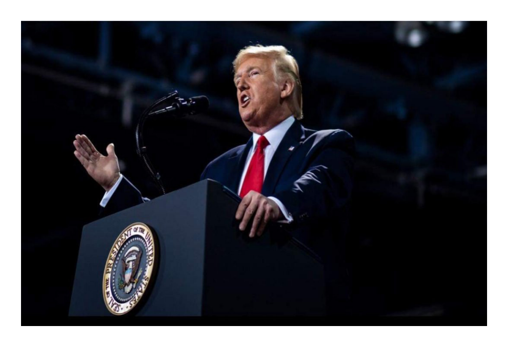
Figure (7): example of the conflict frame