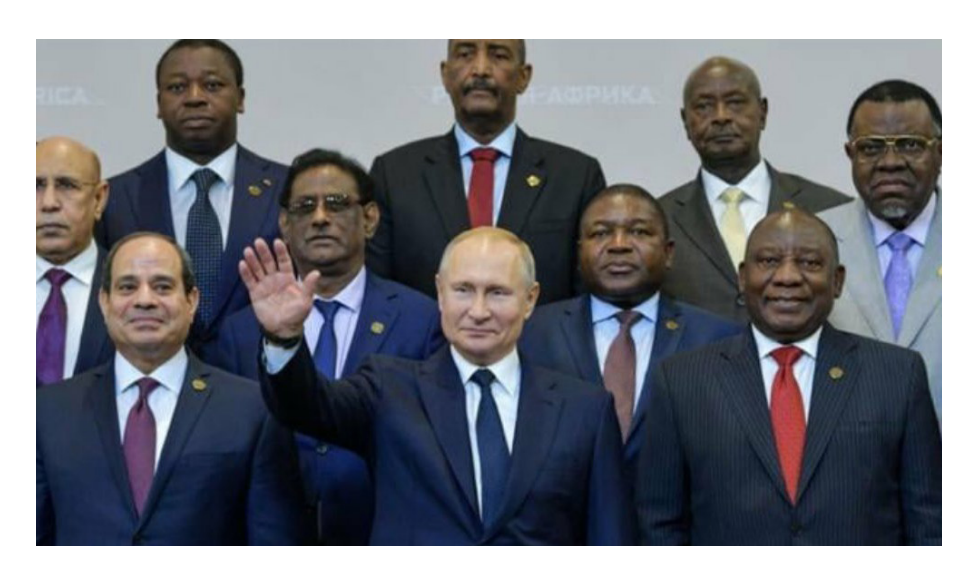
Figure (3): example of the medium distance shot

Trump did not appear as an ordinary man but as a statesman. Trump appeared in all depicted photos even with the American football players wearing formal. However, Putin was depicted in some photos dressing casually, this casual outfit often included rolled sleeves and sports dress which means that CNN tends to make him appear physically active and attempting to connect with common people.