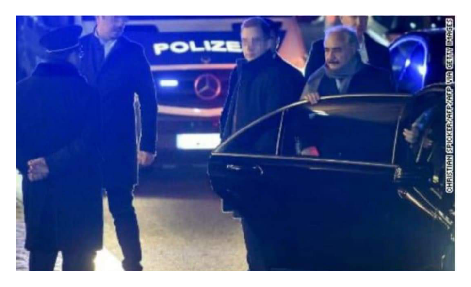
Figure (11): example of the conflict frame