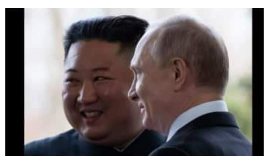
Figure (4): example of the close up shot