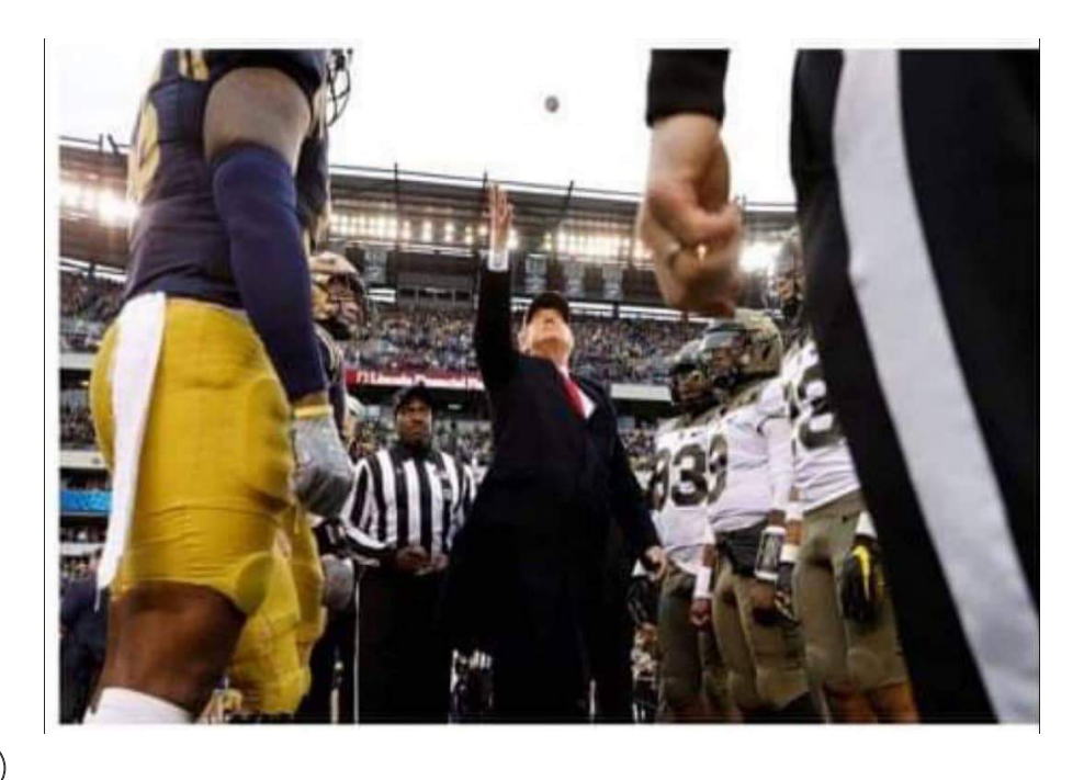
Figure (9): example of the gain frame