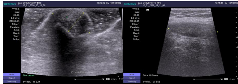
Figure (4) nerouma detected at femoral and sciatic nerve Largest sciatic measured 46 mm and terminal femoral one measured 15 mm