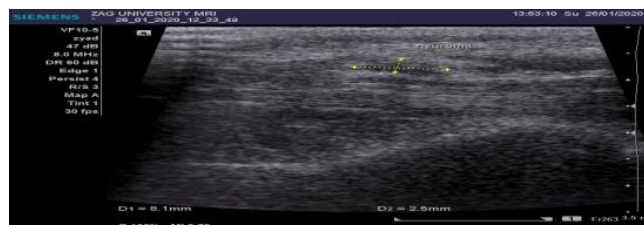
Figure (3) nerouma measured 8 x 2.5 mm in one branch of meidian nerve.