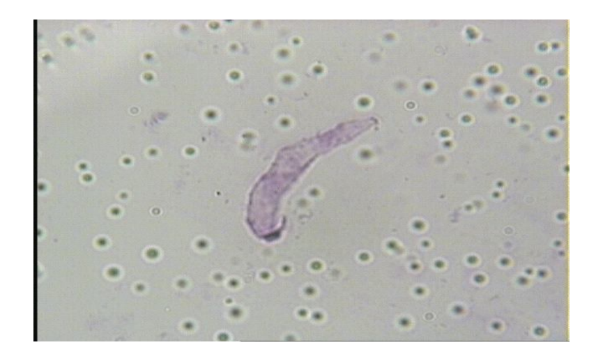
Fig.2: Histological slide HE stained, visualized by light microscopy showing Lymnaea sp. infected with redia.

Under light microscopy analysis, redias of Fasciola were found in the lumen of different segments of the digestive tract of Lymnaea sp. (Fig.2) The present study is the first of its record in this region.