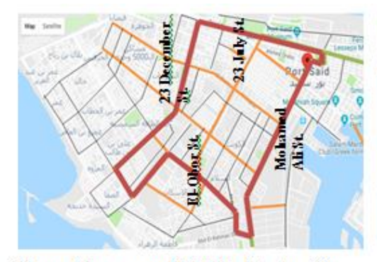
Figure: 5 the proposed BRT line (strategy 2)