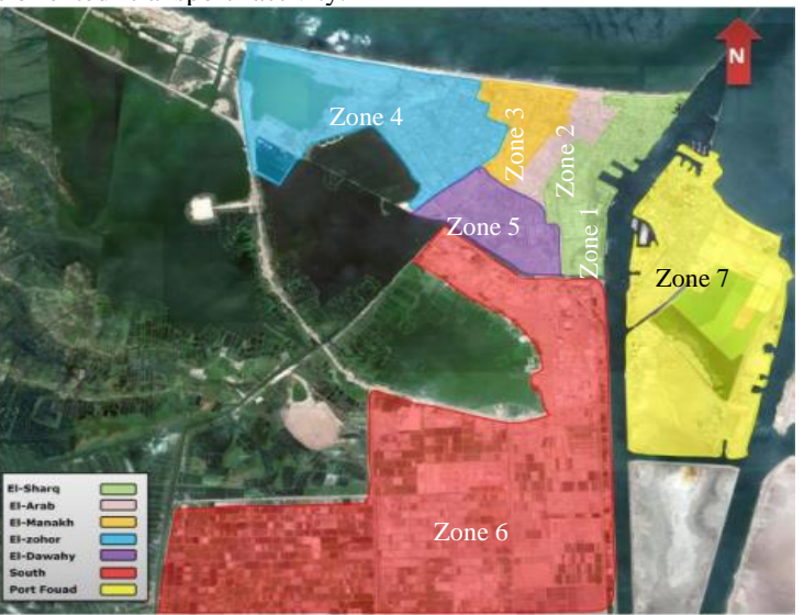
Figure 2: Port Said Study Area Map

The surface area of Port Said city is around 1350 square kilometres with a population around 890,000 inhabitants in 2019. Also, the city has seven main administrative divisions: El Arab, Ganoub, El Zohour, El Dawahy, El-Manakh, El Shareq, and Port Fouad [4] as shown in Fig. 2. The city hosts some remarkable monuments and sites making it the second largest port in one of the most important cities in Egypt besides its vital location at the Northern entrance to the Suez Canal. The present Port Said transport system characteristics and problems are briefly illustrated.