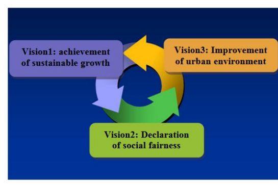
Figure 1: FS social and economic visions

Received: 11-01-2021, Accepted: 24-05-2021 DOI: <u>10.21608/PSERJ.2021.57603.1087</u>