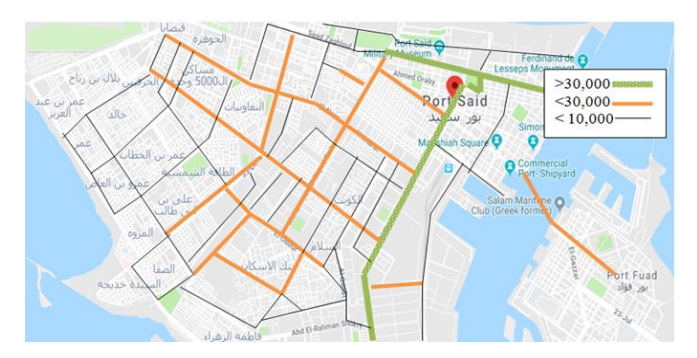
Figure 4: Port Said city traffic demand map, base year 2019