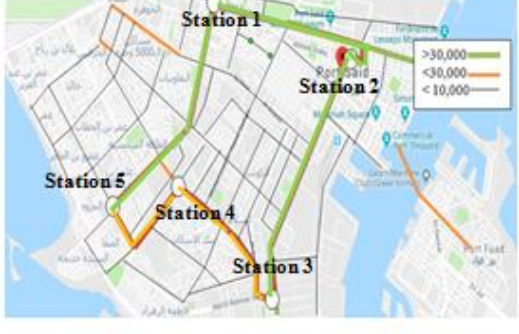
Figure: 6 the estimated Port Said city traffic demand map for strategy 2

The traffic assignment is made before policy using data collection of trips in 2019. The assignment is estimated using two stages capacity restraint method using Bureau function for the relation between the estimated times and travel demand after BRT [16]. The expected time is calculated according to the speed and distances. When comparing the previous assignment with other in strategy 1, traffic demand at all links inside the polygon had been reduced as shown in Figures 5, 6. More than 37% of car users are expected to use BRT instate of their cars when transport from/to any zone on the selected main arterial roads. The reason of such reduction that people who use passenger car is expected to go towards using BRT with low fare according to low income levels. For trips from/to downtown, the travel time is expected to be reduced compared with travel time using any other transport mode because of a high speed of BRT.