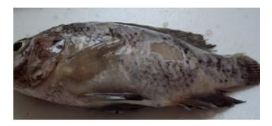
Fig. 2: Nile tilapia, experimentaly injected with Streptococcus faecium isolated from P. clarkii showing detachment scales and skin ulceration