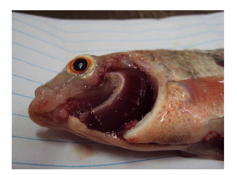
Fig. 1 : Nile tilapia, experimentaly injected with Streptococcus faecium isolated from P. clarkii showing petechial haemorrage in mouth region and fin

Table 1: Cultural and biochemical characters of the isolated bacteria (n=56):