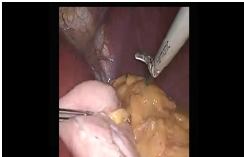
Figure (2): left hand grasper pulls the stomach and push the liver laterally to facilitate dissection of the greater curvature