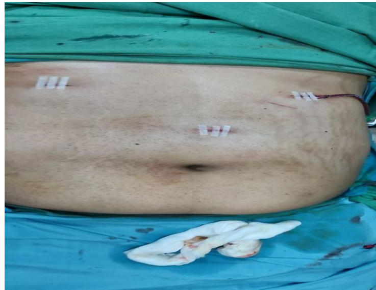
Figure (4): Final appearance and closure.