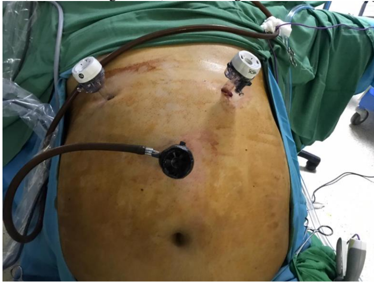
Figure (1): Ports insertion in three port laparoscopic sleeve gastrectomy.

Fisher's exact test, P < 0.05 is significant, NS: Non-significant