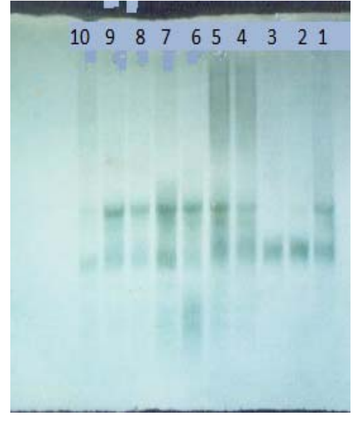
Fig. 2: Polyacrylamide gel zymogram of esterase isozyme patterns in different population governorates.

Esterase have been classified according to their action with various specific enzyme inhibitors (Bush et al. , 1970) Three classes of esterases Could be identified as cholinesterase, carboxyesterase and arylesterase based on the substrate specificity and inhibition tested in 4<sup>th</sup> larvae instars (Augustinsson