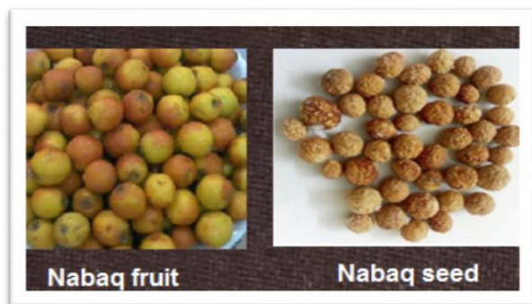
Fig. 1. The general appearance of fruits and seeds of Nabaq ( Z. spina-christi ).

stainless-steel knife. Fruit pulp and seeds were dehydrated at 45°C for 12 h in a thermostatically controlled hot air oven (Memmert UN750, Germany). The dehydrated pulp and seeds were ground using a milling machine (Culatti Hammer Mill DCFH 48, Germany), then packed in air-tight Kilner jar and stored in a refrigerator (4°C) until used.