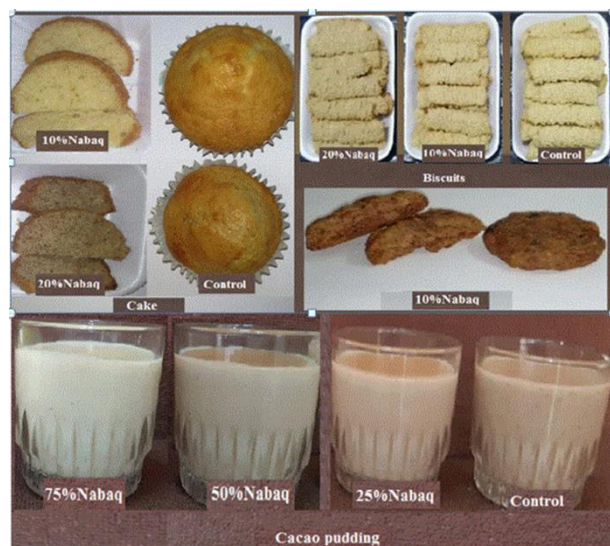
Fig. 3. The general appearance of some food products containing dehydrated Nabaq pulp and seeds.

Mean± SD of triplicate analysis. LSD: Least significant differences. Mean in a column not sharing the same letter are significantly different at p ≤ 0.05. *Biscuits prepared with dehydrated Nabaq seeds, **Cakes, Chocolate chip cookies and Cacao- pudding prepared with dehydrated Nabaq pulp.