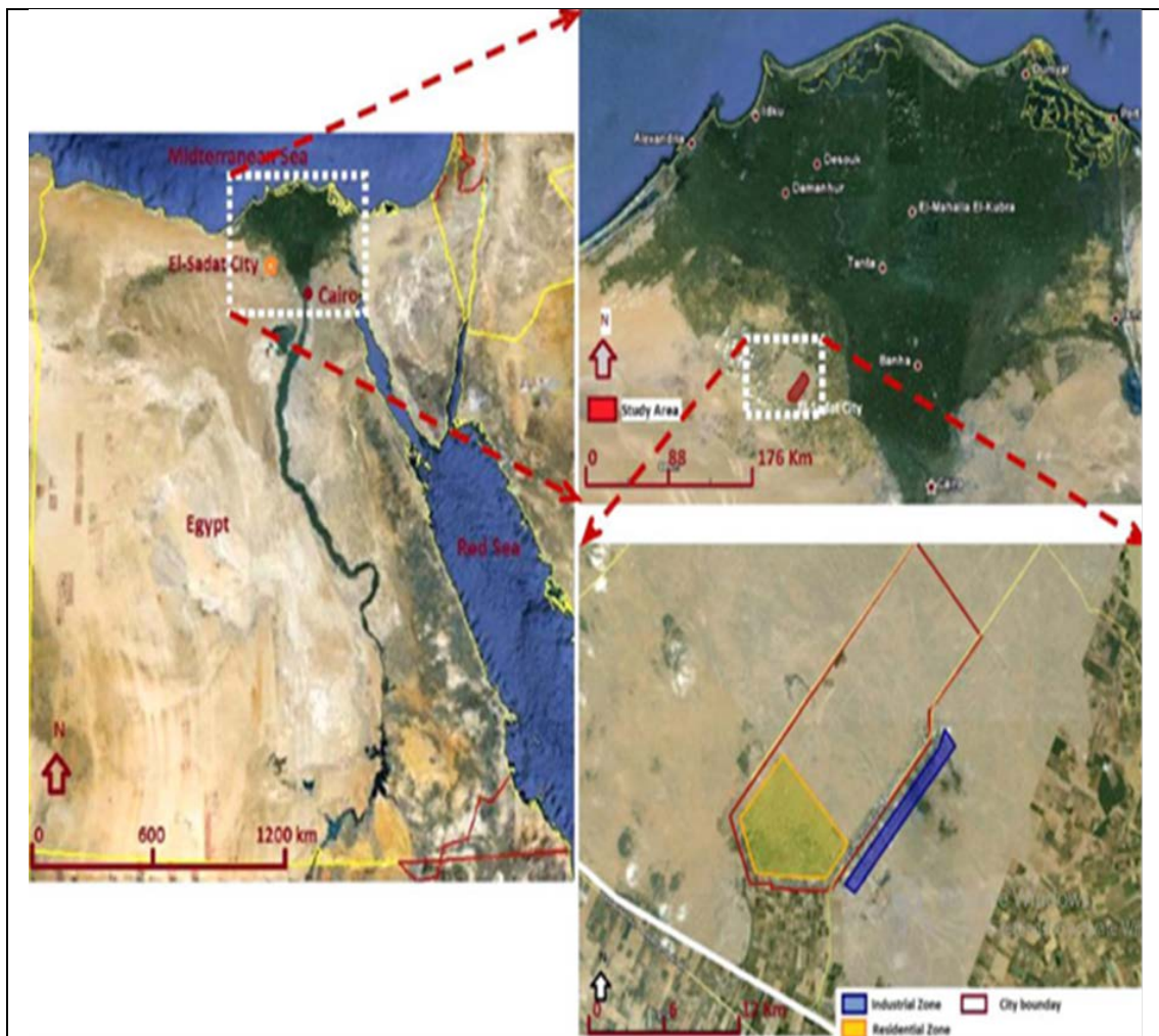
Fig. (1): Location of the study area at south west of El- Sadat City.

profiles were dug deep down to about 120 cm. and morphologically described according to FAO (2006). Soil color was determined in dry and moist samples using the Munsell Color (1992). The important morphological features such as soil color, texture, structure, consistence and the boundary between horizons were used for evaluating the pedological development according to Bilzi and Ciolkosz (1977). Soil samples were collected from each horizon of the soil profiles and were air dried. Particles with a diameter less than 2 mm were used for the physio-chemical analyses.